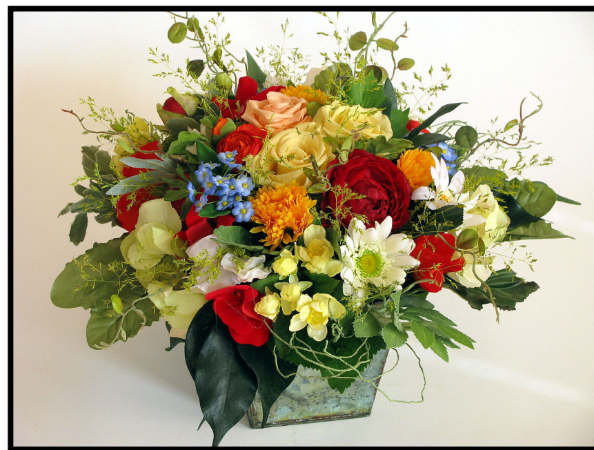
March 28, 2020