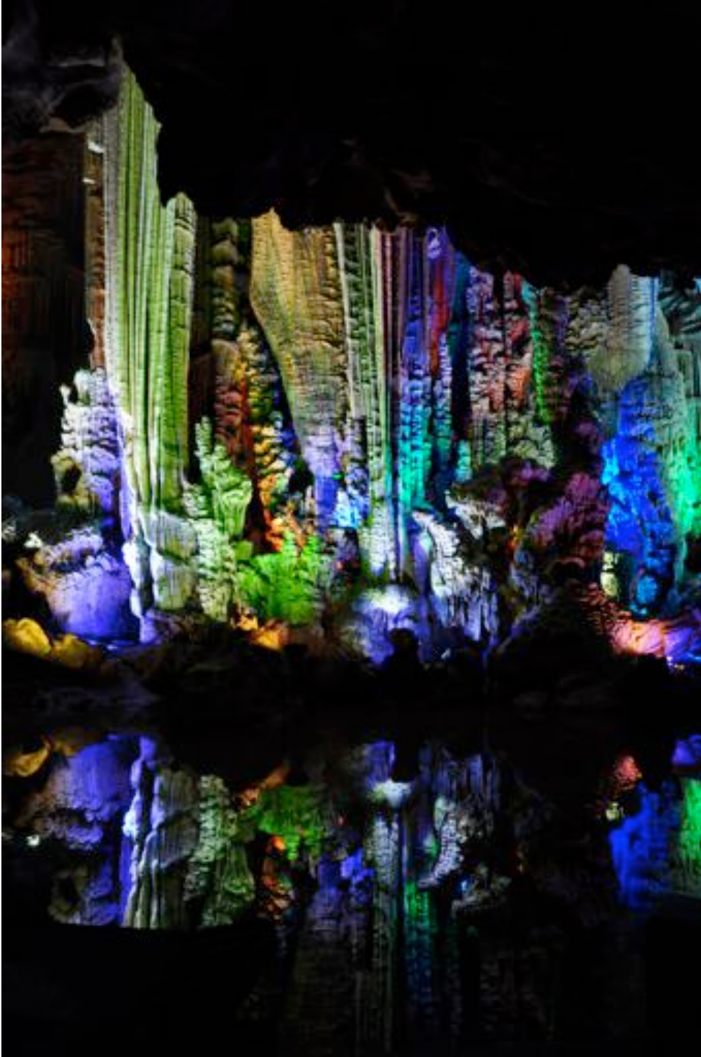
I - Miroirs