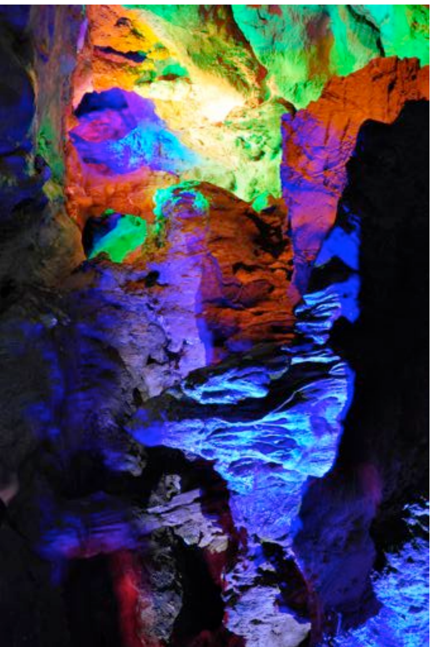
III - Reliefs