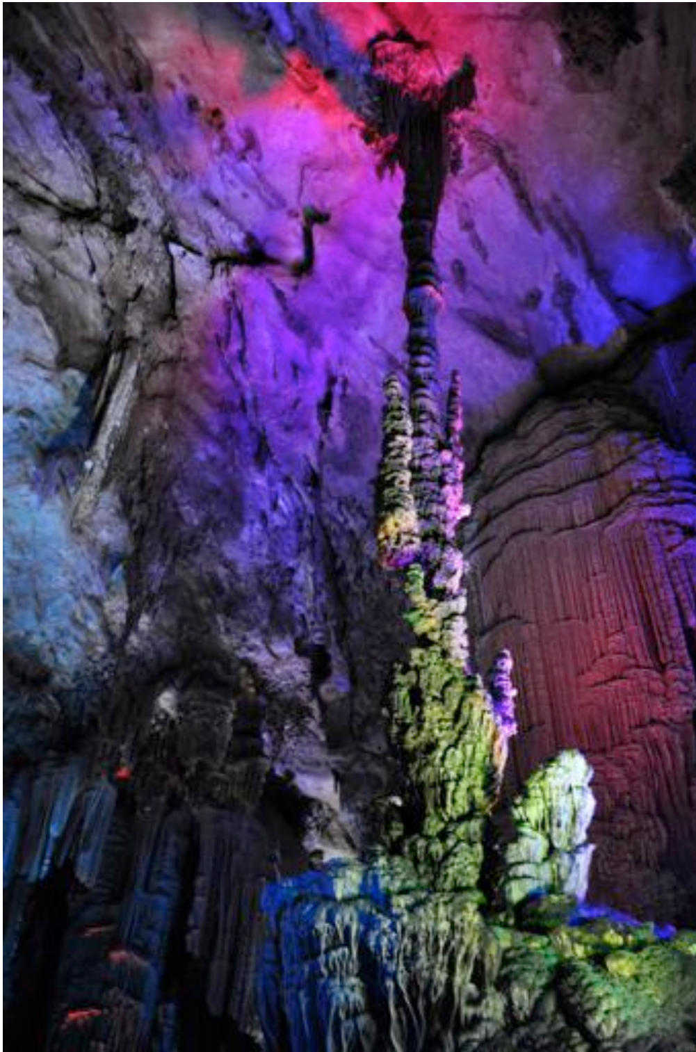
VI – Isochronie 3 / Cadence