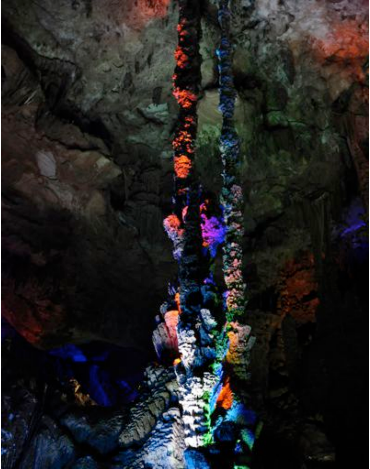
IV – Isochronie 2