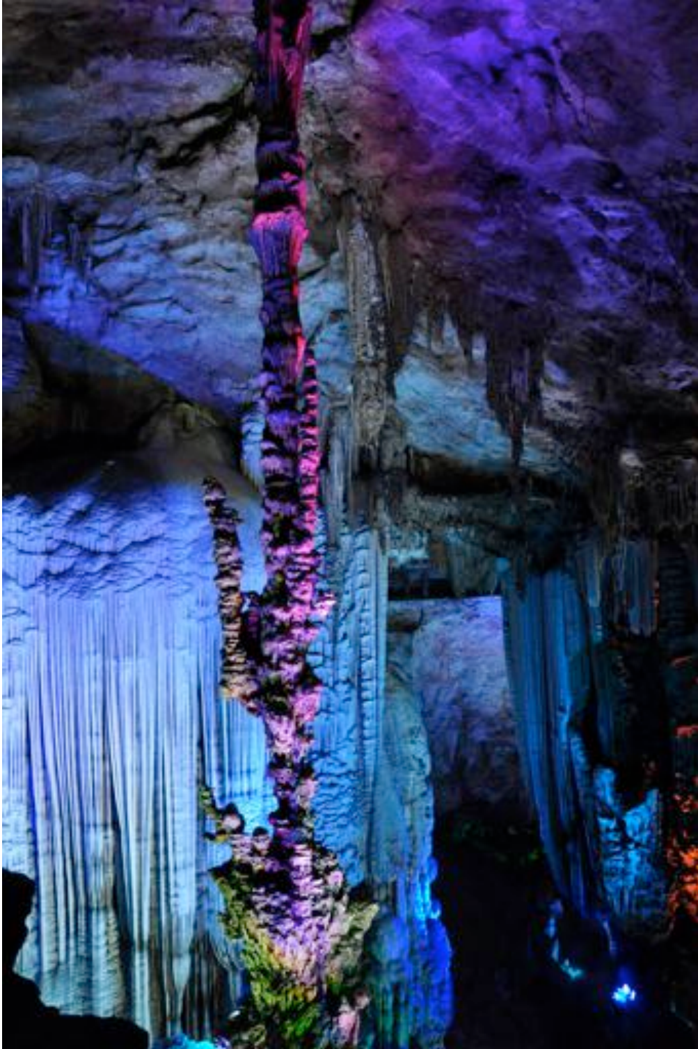
II – Isochronie 1