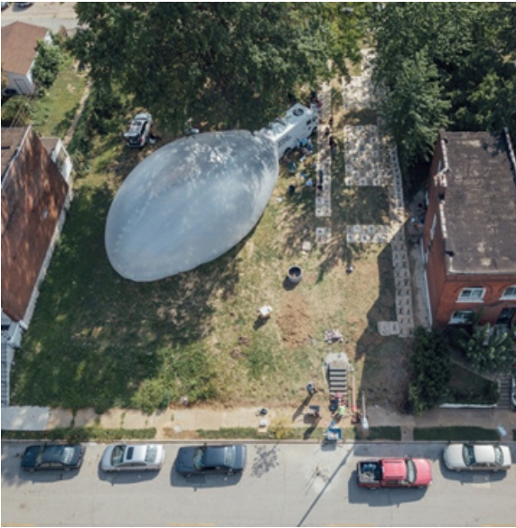
Micah Stanek's spring 2018 course Research in the Landscape: Methods and Practices designed and installed the Enright Butterfly Garden.