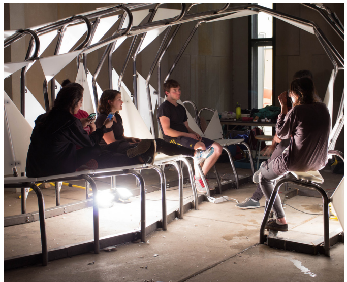
Chandler Ahren's spring 2016 undergraduate design-build studio created iconic seating and shade structure for the Nahed Chapman New American Academy.