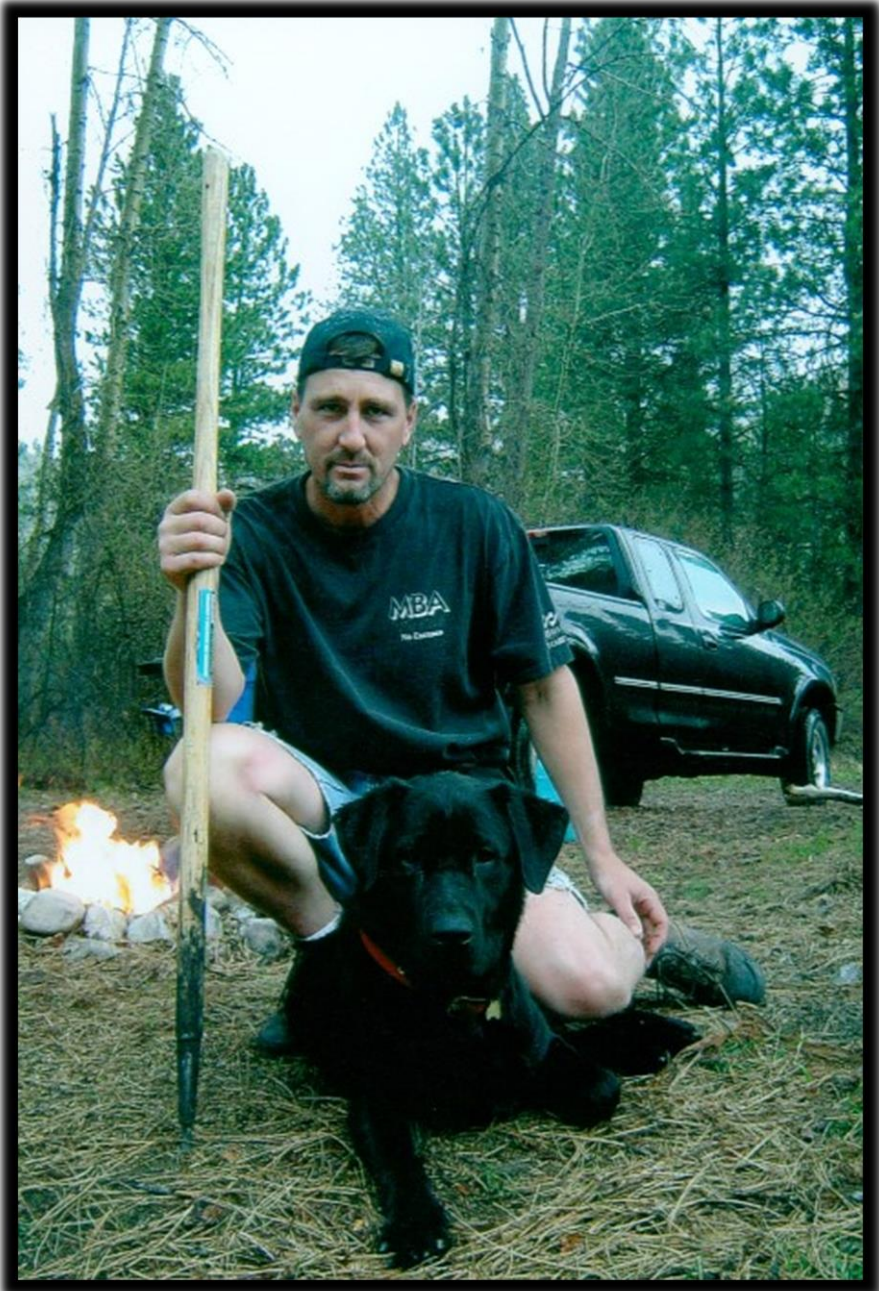
"We are all just walking each other home"