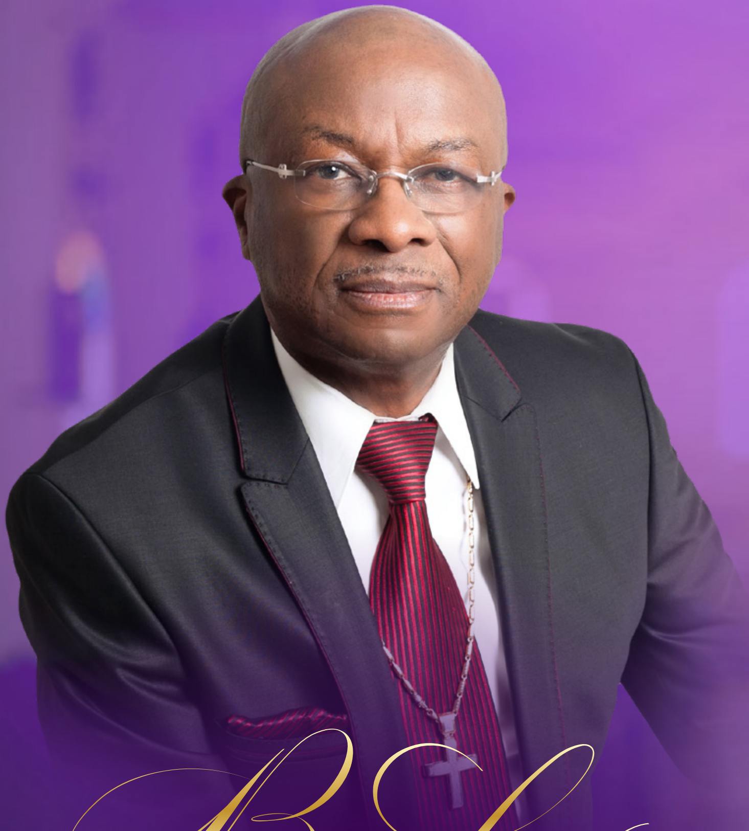
Bishop WILLIAM RALPH JONES