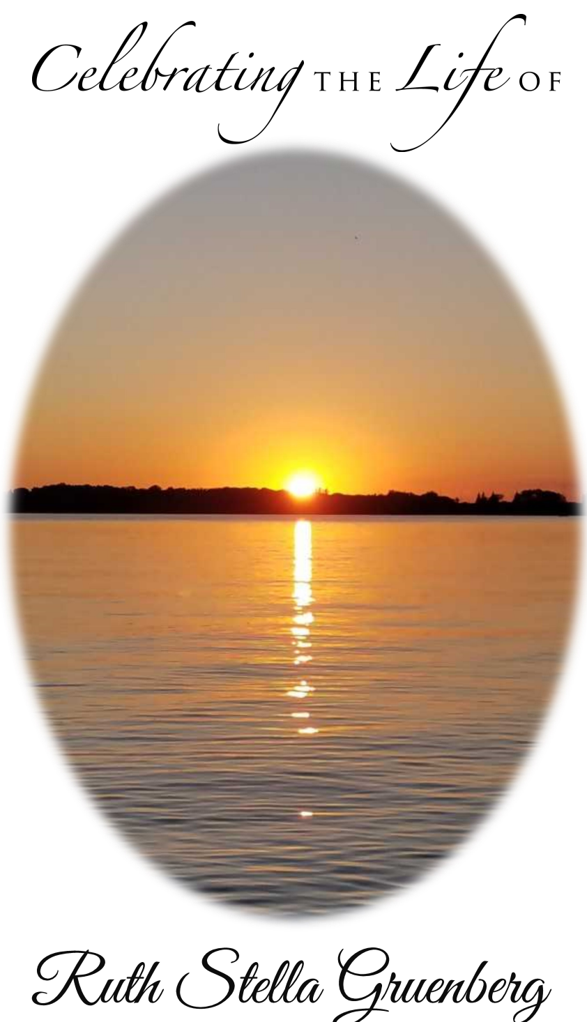
May 20, 1933 — July 22, 2019