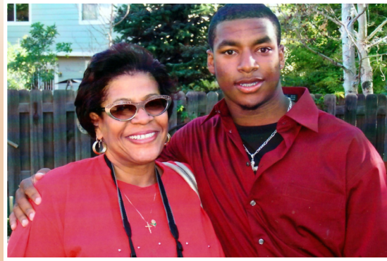
after many years of faithful and dedicated service.