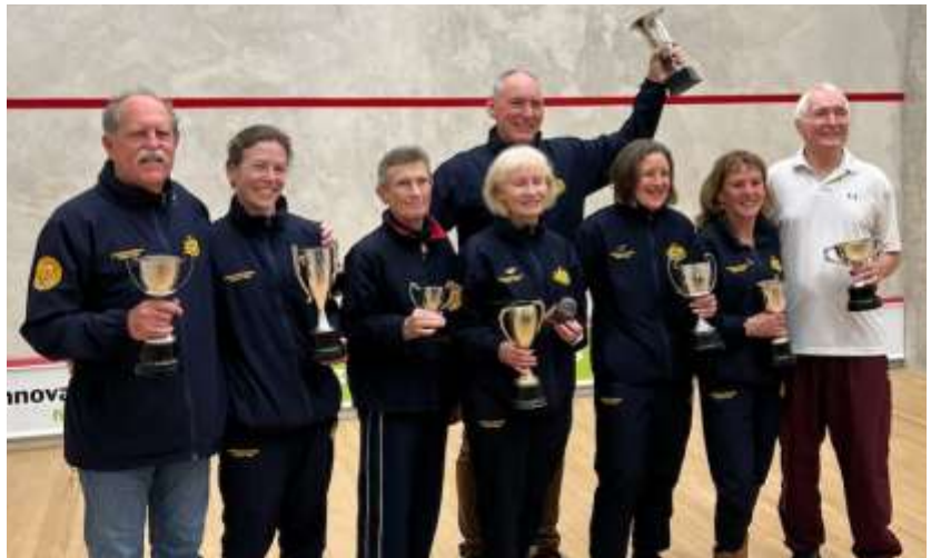
Australians who won age groups in the NZ national teams.