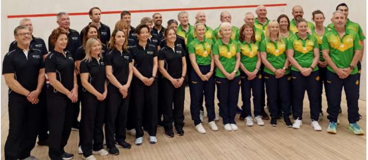
Australian & NZ team photo

I would like to thank everyone back in Tassie who sent me messages of support and Tas Masters Squash for providing $400 towards my expenses.