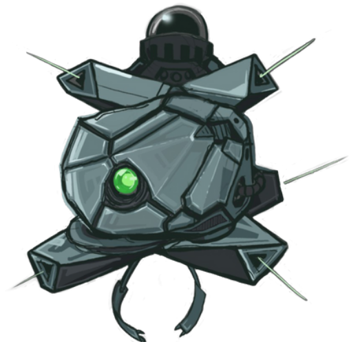
Right: VAILIEN pet in VAIL VR

An NFT, or non-fungible token, is a unique digital asset whose data is stored on a blockchain. NFT ownership is digitally verified by the blockchain to protect authenticity of the asset.