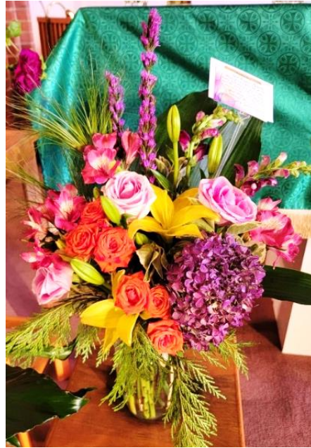
The Lingle & Stege Families