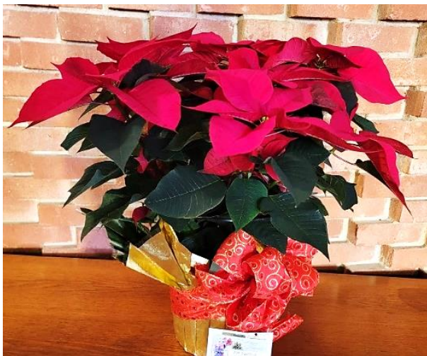
Your friends at the Scotland Schools