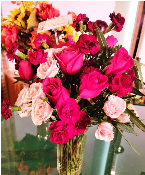
Your family at First National Bank