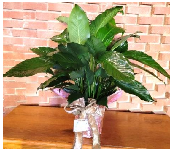
Your friends at Lakes Gas