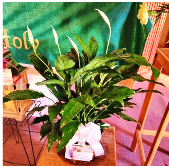
Your Avera Family