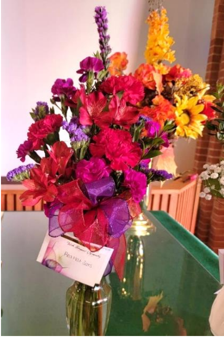
Red Hat Scots