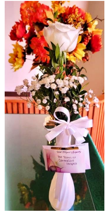
The Team at CentraCare Hospice