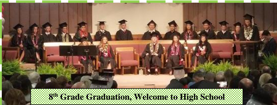
8 th Grade Graduation, Welcome to High School