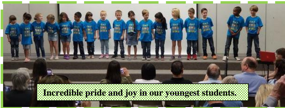
Incredible pride and joy in our youngest students.

For this 2018-2019 school year we can say: "Therefore, since we are surrounded by such a great cloud of witnesses, let us throw off everything that hinders and the sin that so easily entangles. And let us run with perseverance the race marked out for us, fixing our eyes on Jesus, the pioneer and perfecter of faith." Hebrews 12:1, 2