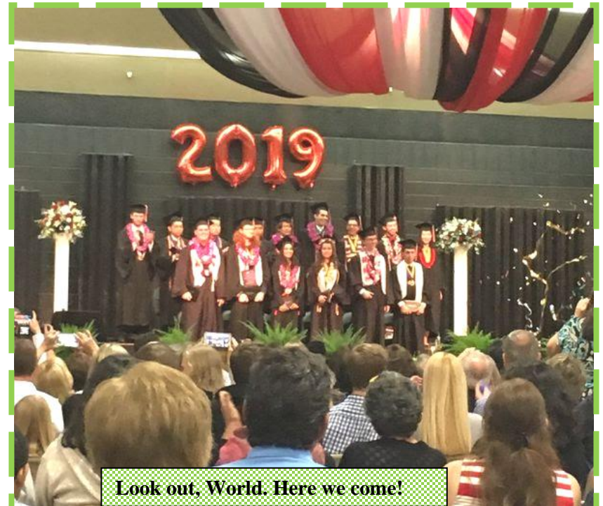
Look out, World. Here we come!