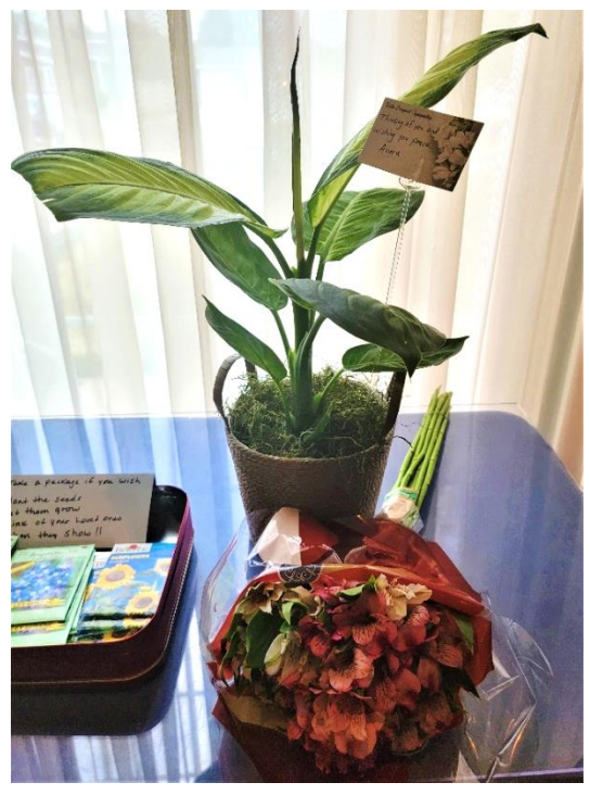
Thinking of you and wishing you peace. Avera