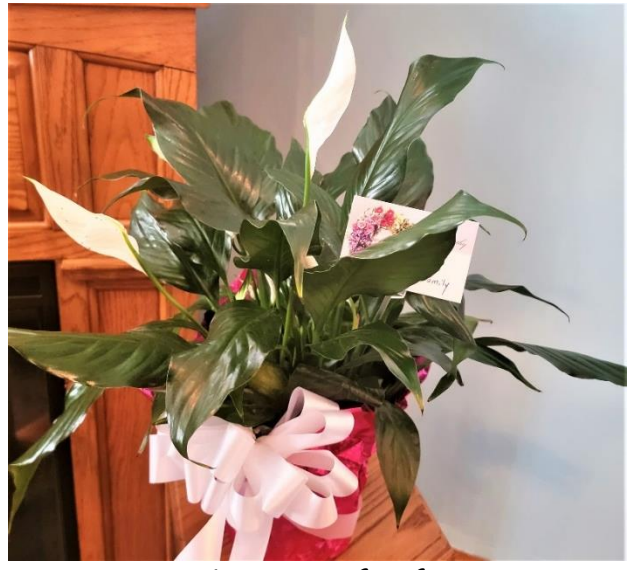
Your Avera family