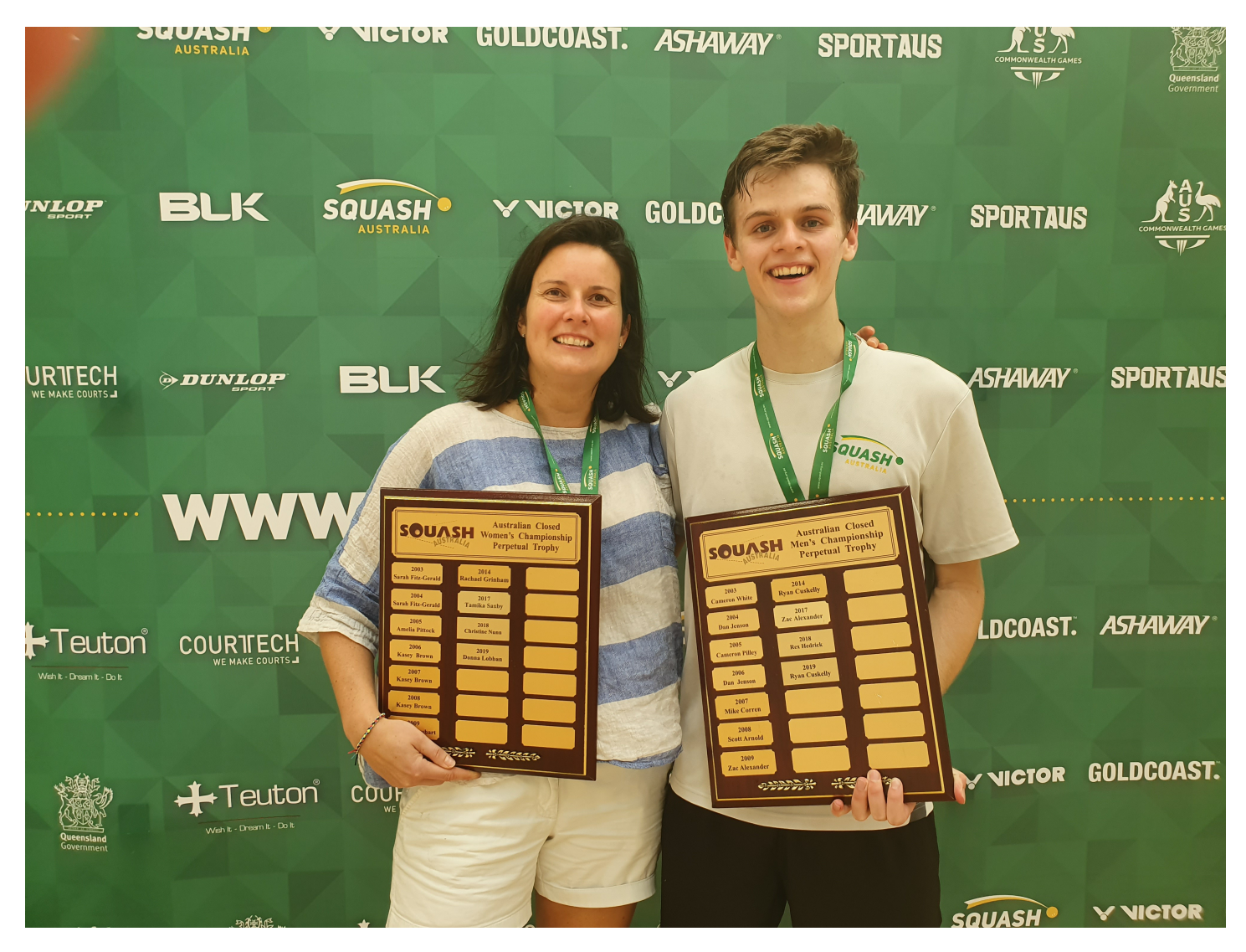
AUSTRALIAN NATIONAL CHAMPIONSHIPS - 2020