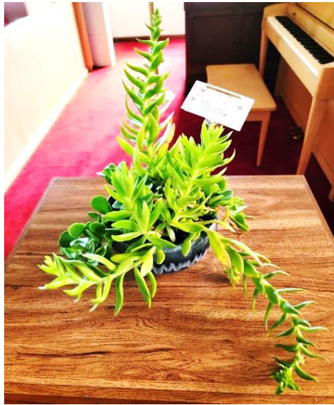
First Circuit Clerks & Deputies