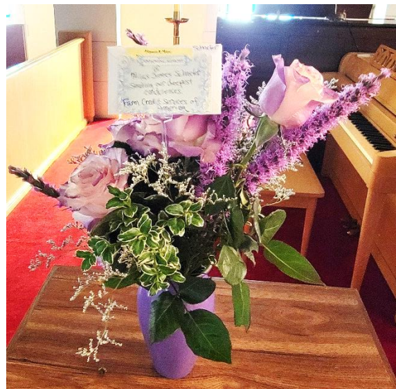
Farm Credit Services of America