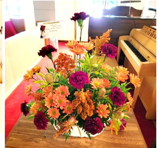
East River Electric Employees