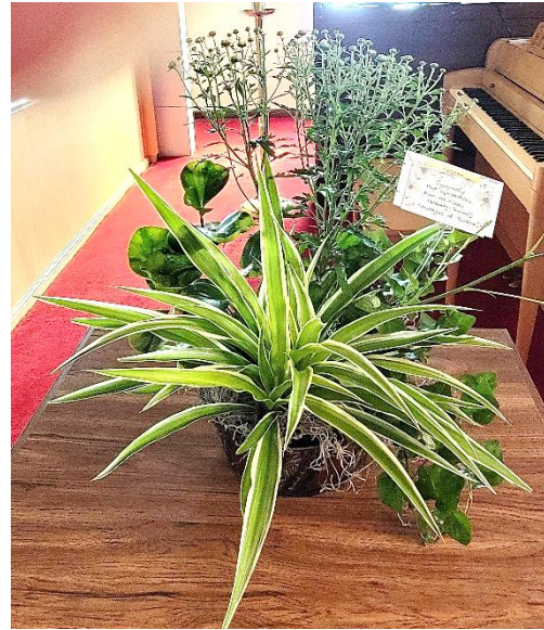
ASTEC (Kolberg-Pioneer) Employees of Yankton