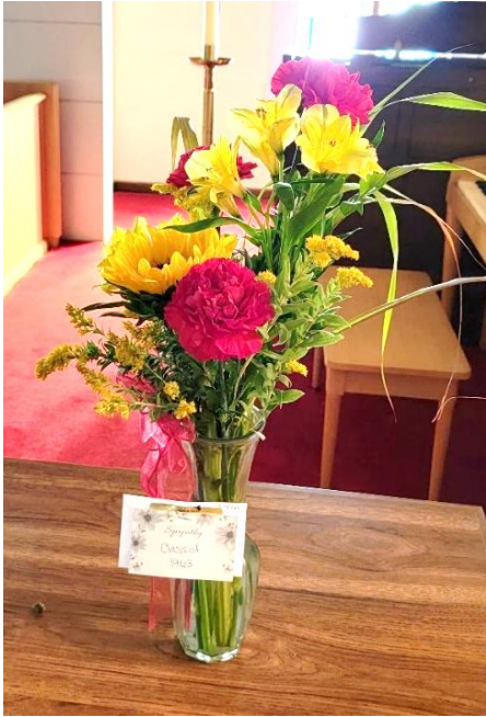
Class of 1963