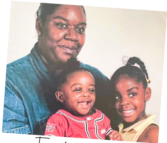
Family is forever!