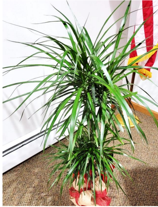
The Anesthesia Department Avera Queen of Peace