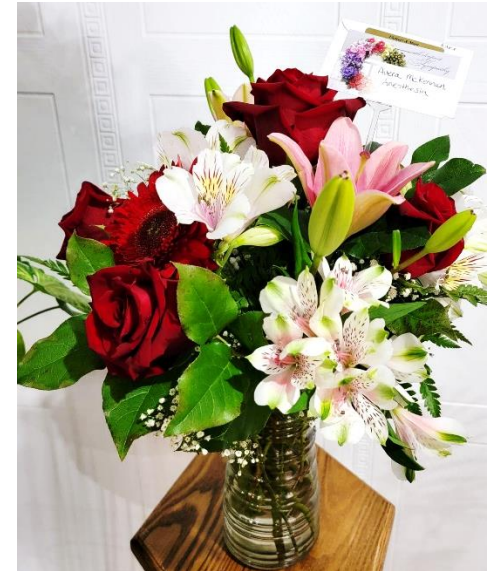
Avera McKennan Anesthesia