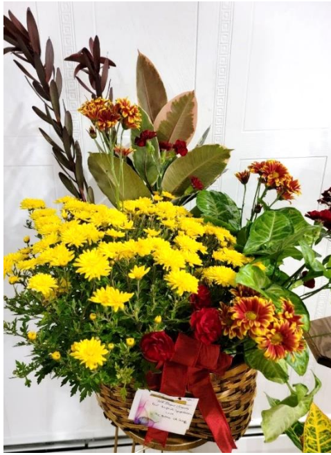
Avera OR Staff