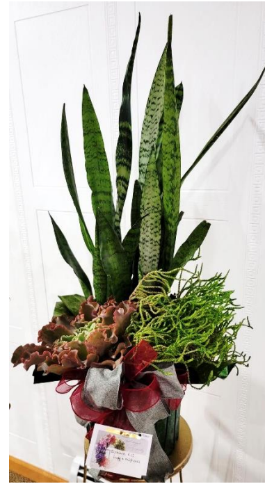
Scotland GSS Staff & Neighbors