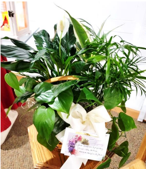
Avera Heart Hospital/NCH