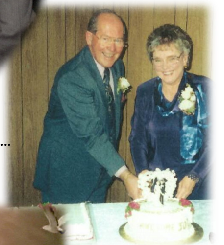
A mother holds her children's hands for awhile... their hearts forever.