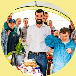
Minister Joe O'Brien Department of Rural & Community Development

When you feel part of a community those challenges are easier to manage - you can keep them at bay."