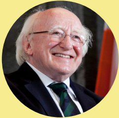
President Michael D. Higgins Patron of Street Feast

"All of our public events gain from the widest community participation. We must all by now realise the importance of community, inclusion, creativity and togetherness - all values that require support and a conscious effort of care, protection and solidarity. Initiatives such as Street Feast provide exactly that type of opportunity."