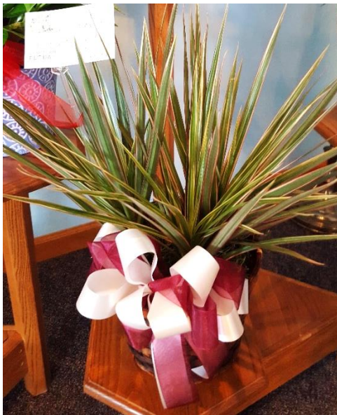
The Odens family