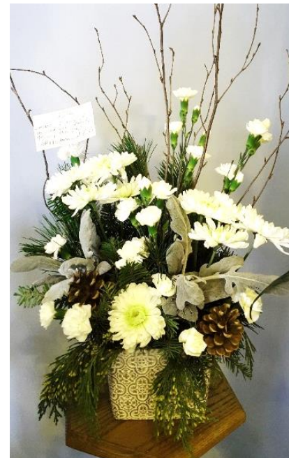
Staff & Leadership at ECG