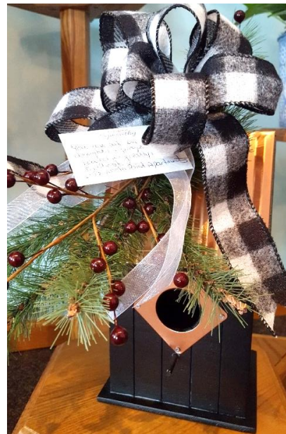
GSS – North Point Apartments.