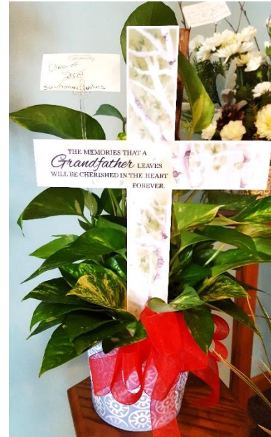
Class of 2002 Bon Homme Cavaliers