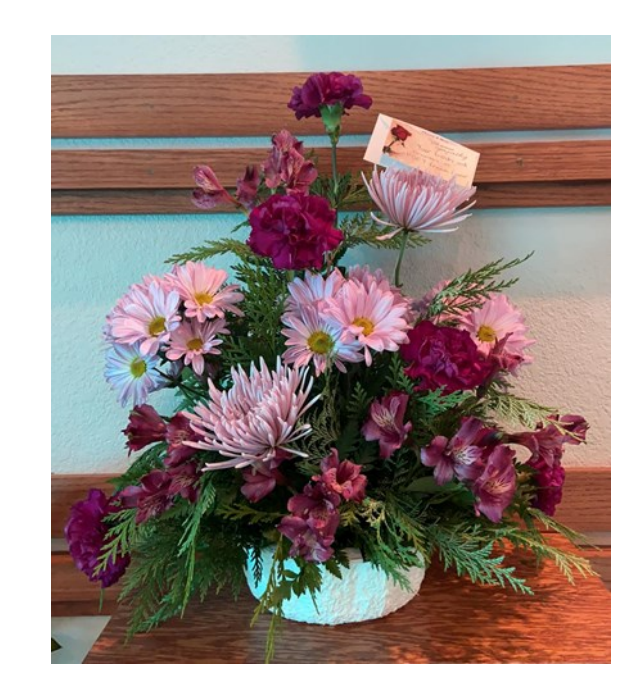
Your friends and co-workers at POET Research Center