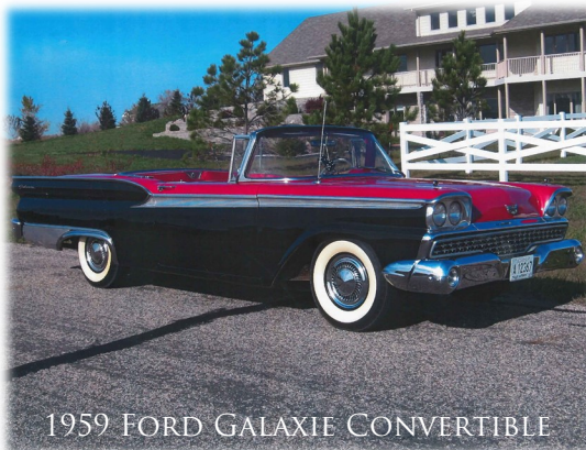
1959 FORD GALAXIE CONVERTIBLE