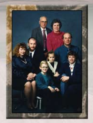
I Believe in Farming

I believe a man's greatest possession is his dignity and that no calling bestows this more abundantly than farming.