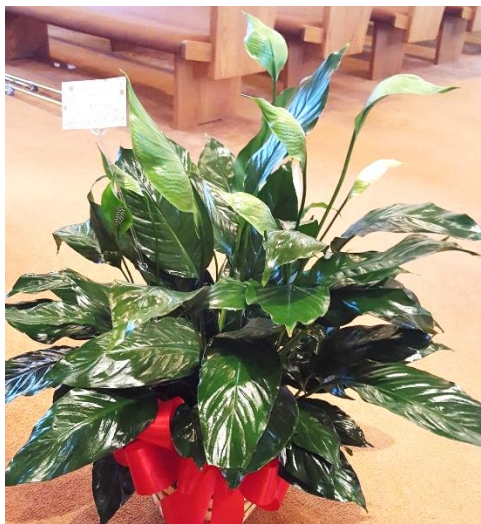
Your friends at SSFCU