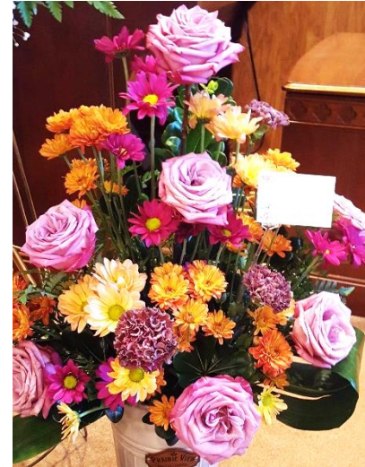
Flamming Grimme Family