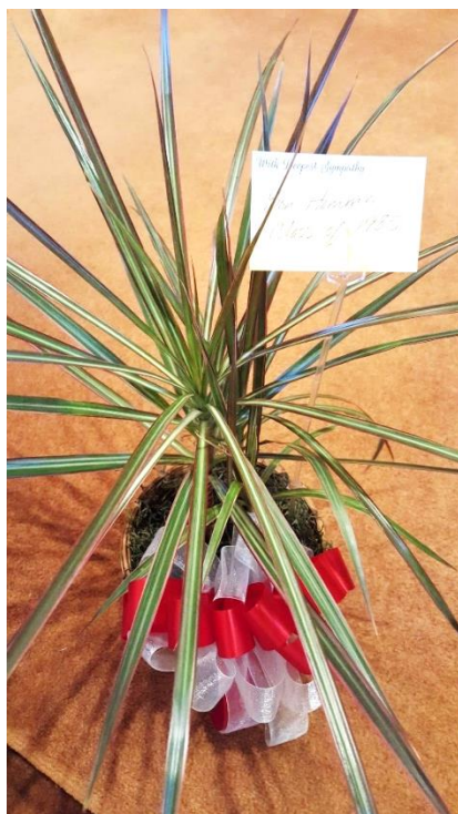
Bon Homme Class of 1983