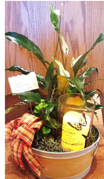
Tyndall Chamber of Commerce