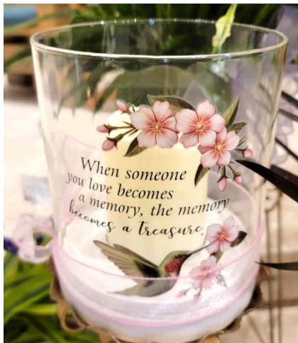
Good Samaritan Staff & Residents