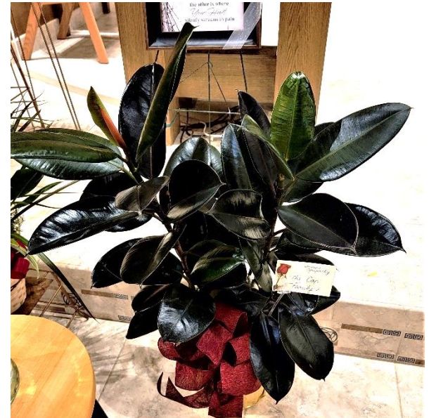
The Cap Family