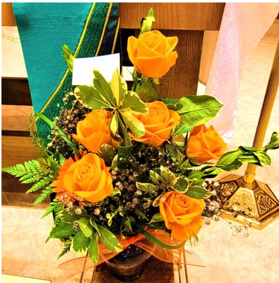
Class of 1976