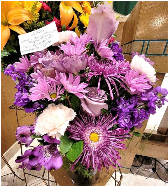
Your friends at Hendrickson, Canton