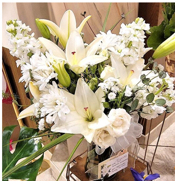
Your Hendrickson Family HR Team