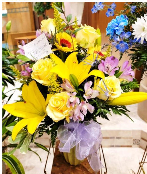
The Hauck Family