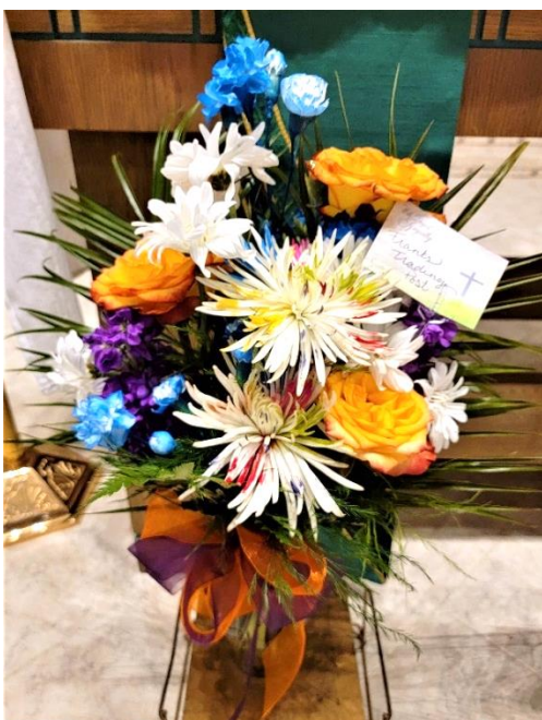
Franks Trading Post