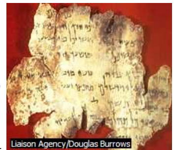
Fragment of the Dead Sea Scrolls.

In 1947 the now famous Dead Sea Scrolls were discovered by a shepherd boy looking for his lost goat. Over time 35,000 scroll fragments from 400 manuscripts including every book of the Old Testament except the book of Esther. Examination of these manuscripts, which were 1,000 years