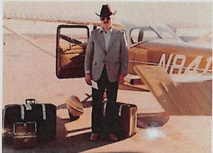
A GREAT MAN A LOVING HUSBAND & FATHER AND THE BEST PAPA EVER