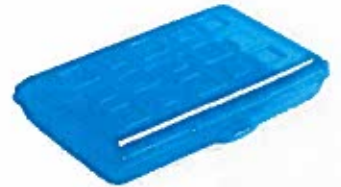
Art Supply Box