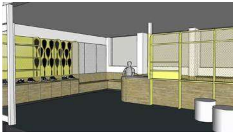
⇐ Pro Shop