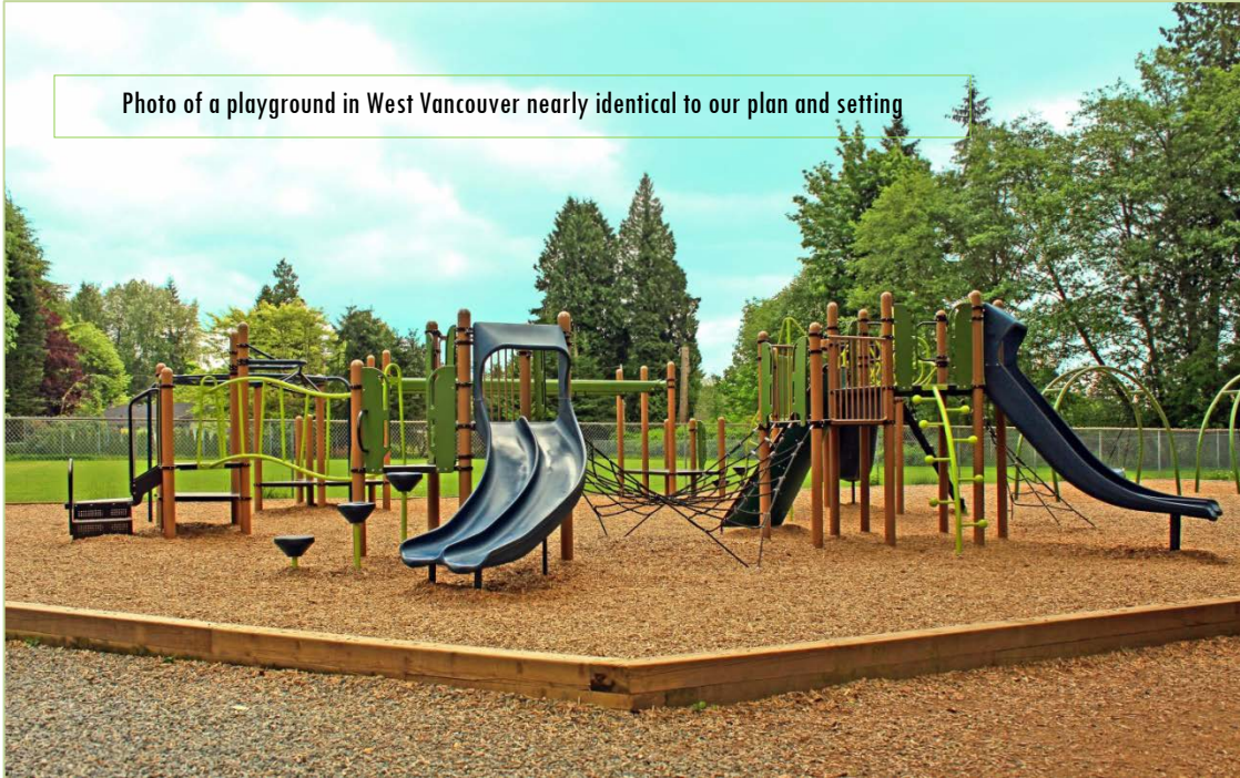
Photo of a playground in West Vancouver nearly identical to our plan and setting