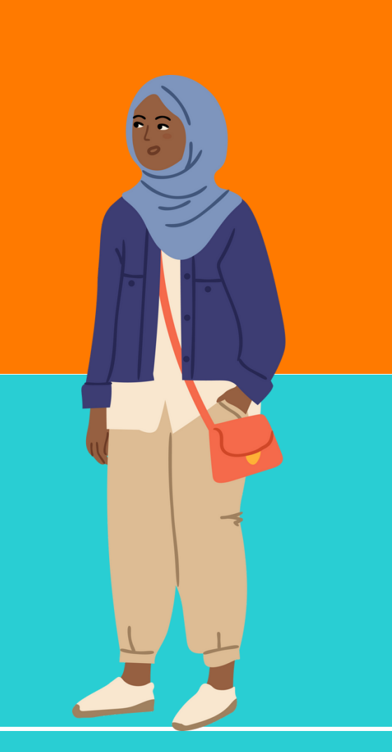
Play Park Leader