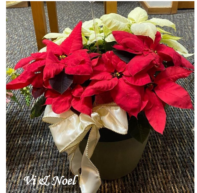
Vi & Noel