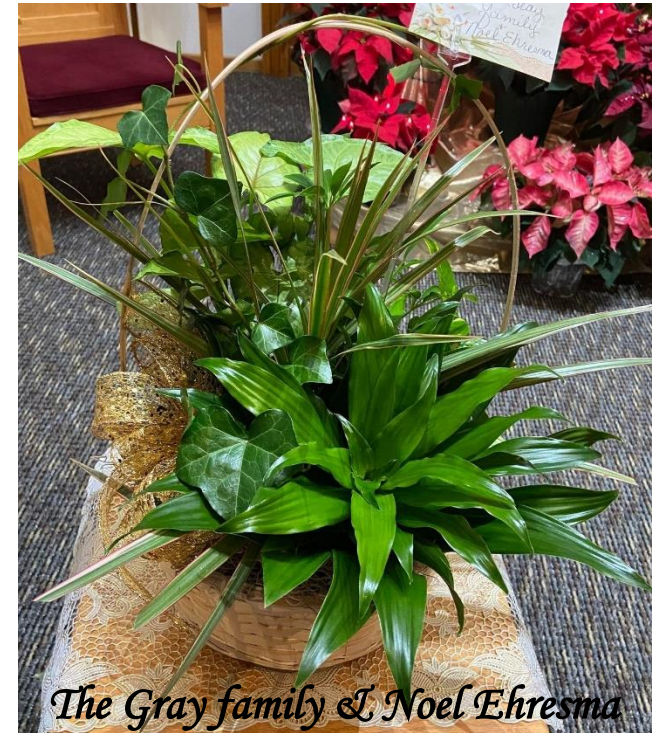
The Gray family & Noel Ehresma