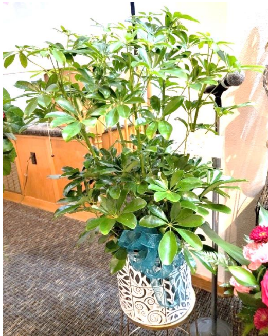
Tripp Delmont School Staff