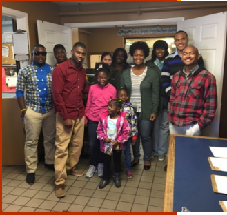
Several of the young adult volunteers at the entrance of The Healing Place

“For I was hungry and you gave me food, I was thirsty and you gave me drink...” Matthew 25:35 ESV