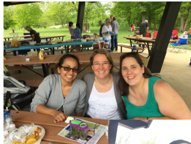
Middletowners enjoying the 2016 Derby Picnic in Beckley Park

The nine members comprising the current Social Committee work hard to organize a variety of creative, fun events and activities to foster positive relationships and help members to connect with each other socially as well as spiritually. The committee meets annually in August to plan nine activities for the entire year. Past event favorites have included the annual Super Bowl Party and Progressive Christmas Party. Recent new additions to the social line-up included a Sabbath walk and picnic at