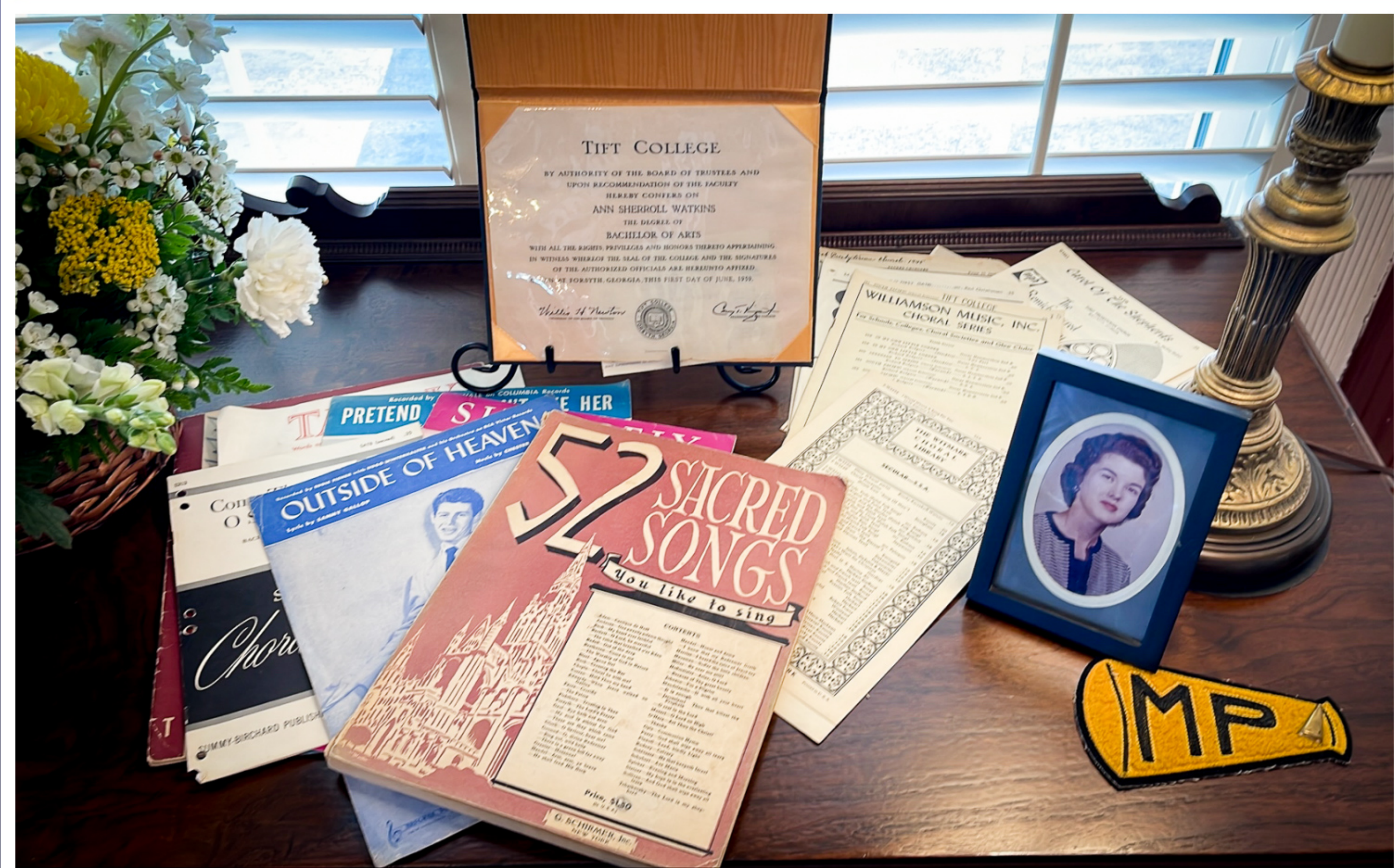
Monroe County Memorial Chapel