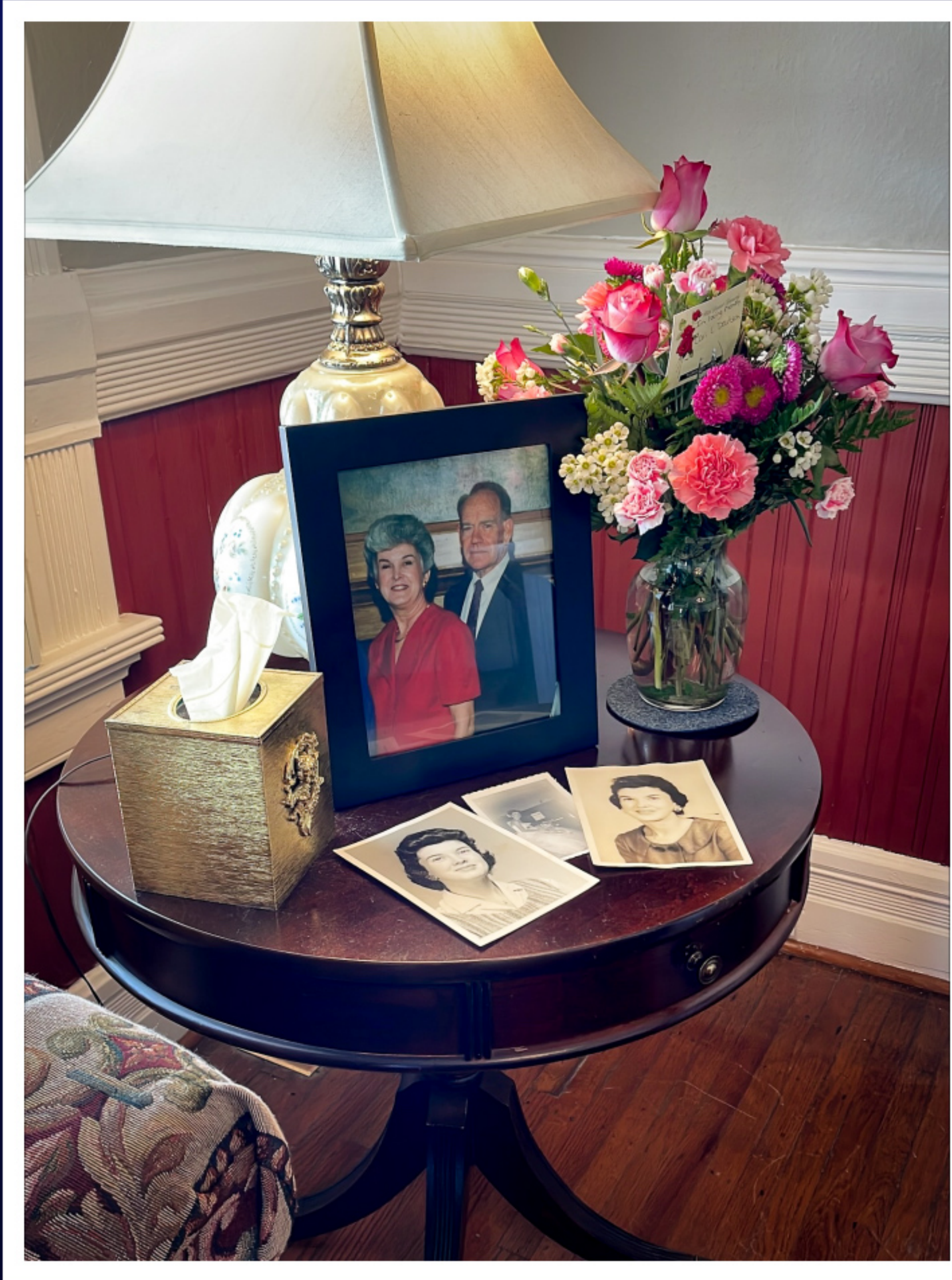
Monroe County Memorial Chapel