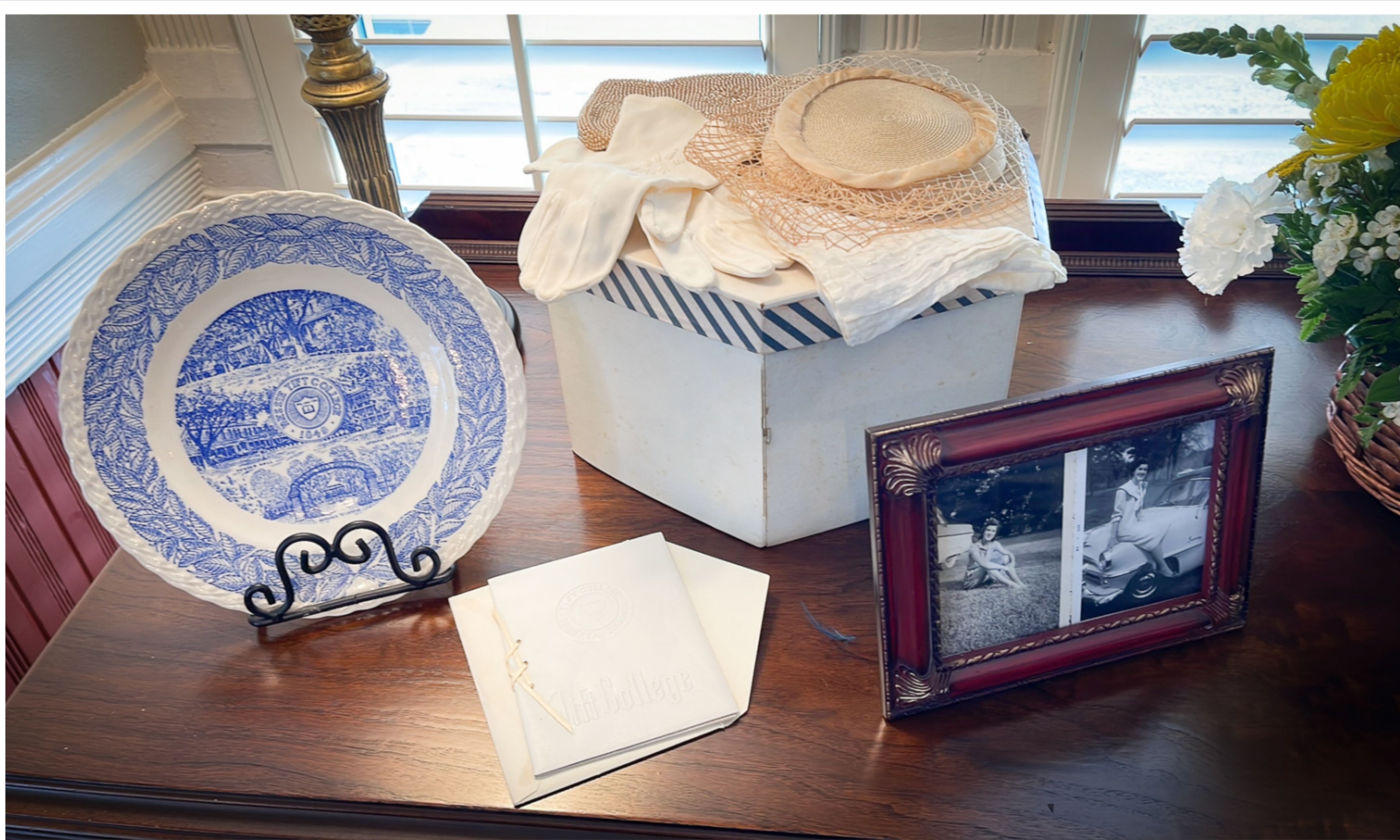
Monroe County Memorial Chapel