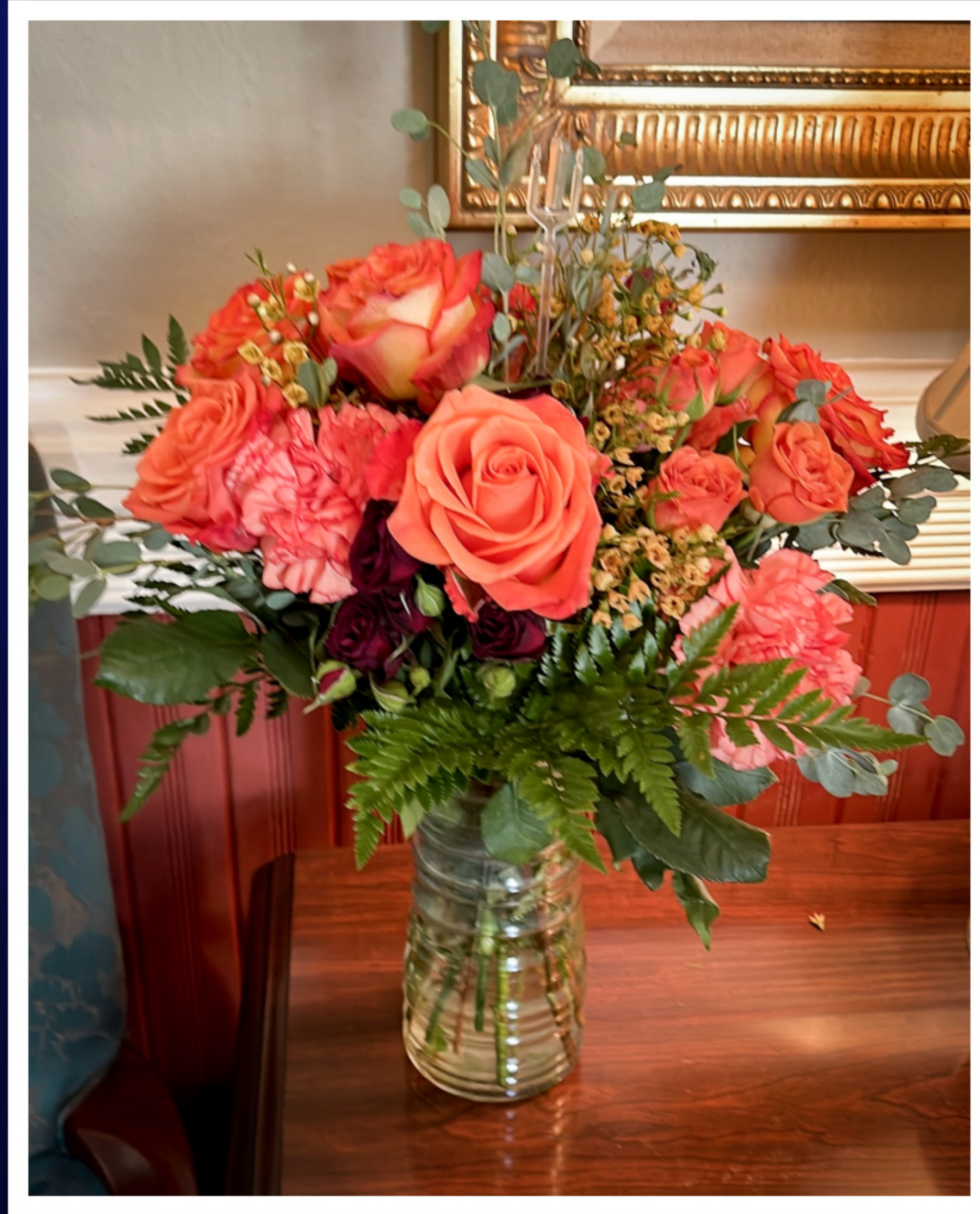
Monroe County Memorial Chapel