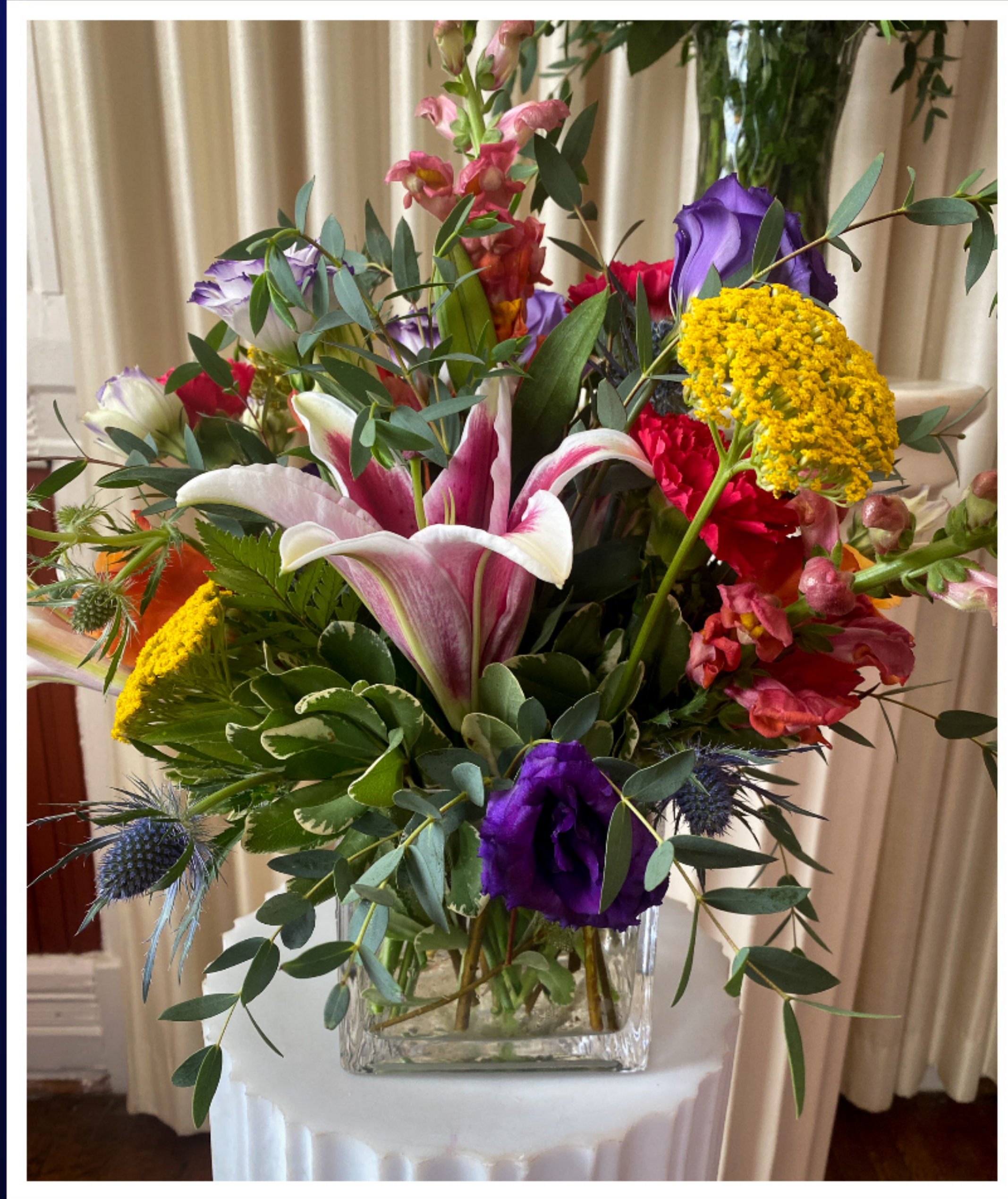
Monroe County Memorial Chapel