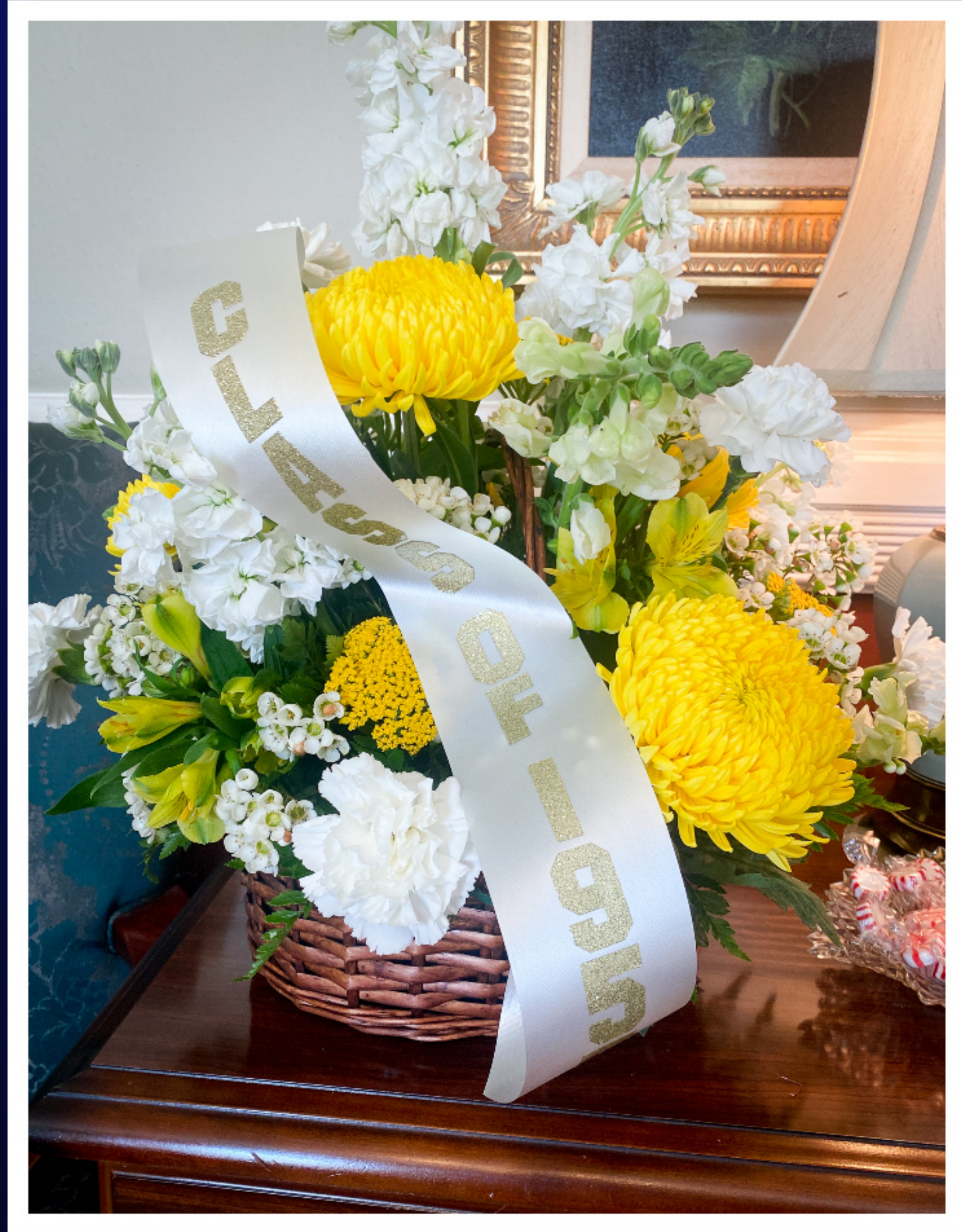
Monroe County Memorial Chapel