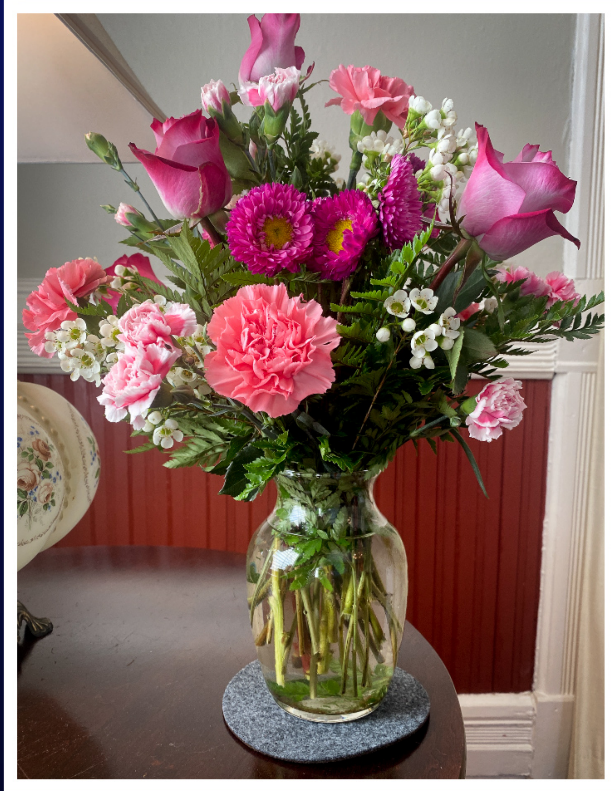
Monroe County Memorial Chapel