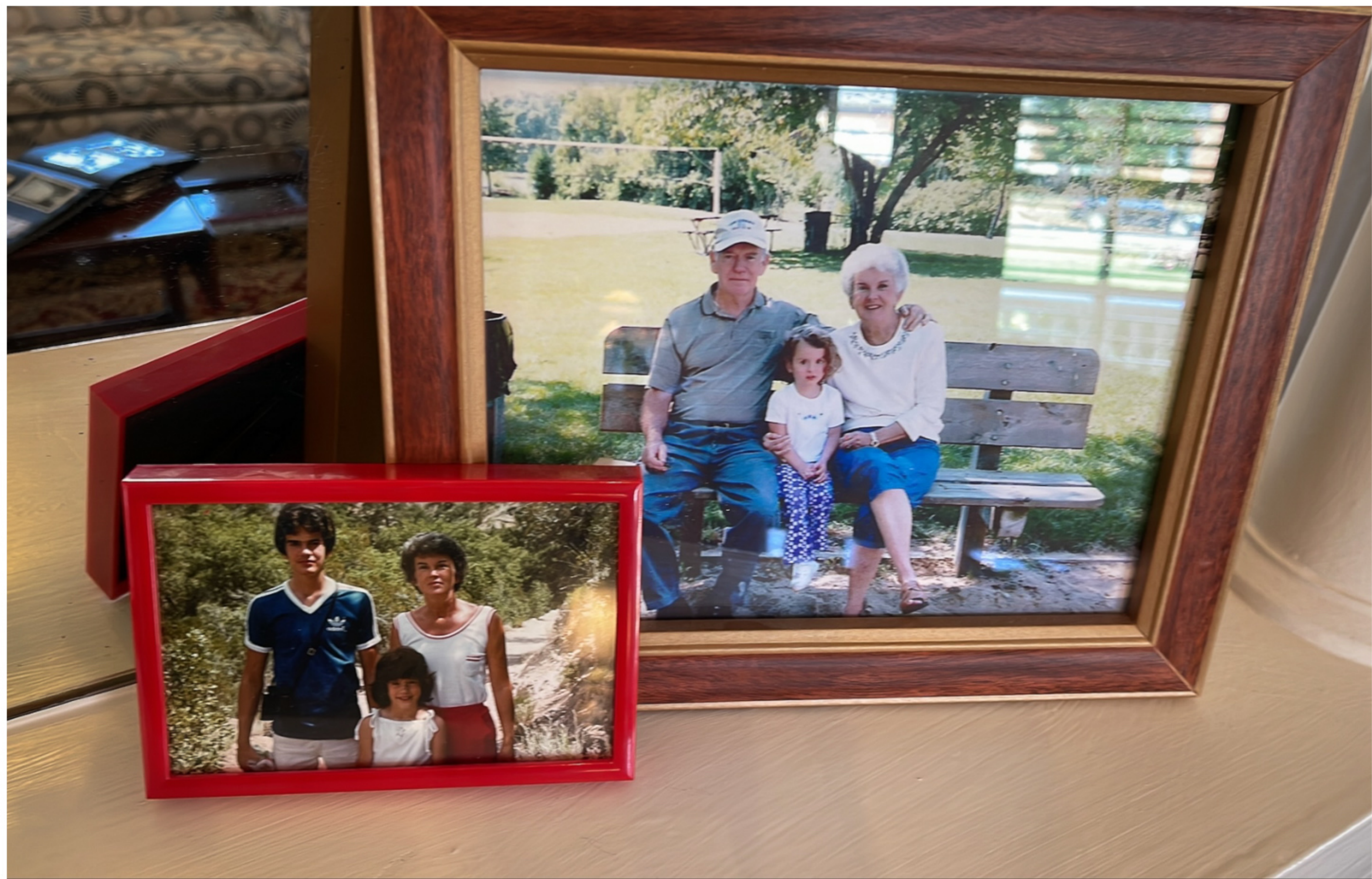
Monroe County Memorial Chapel