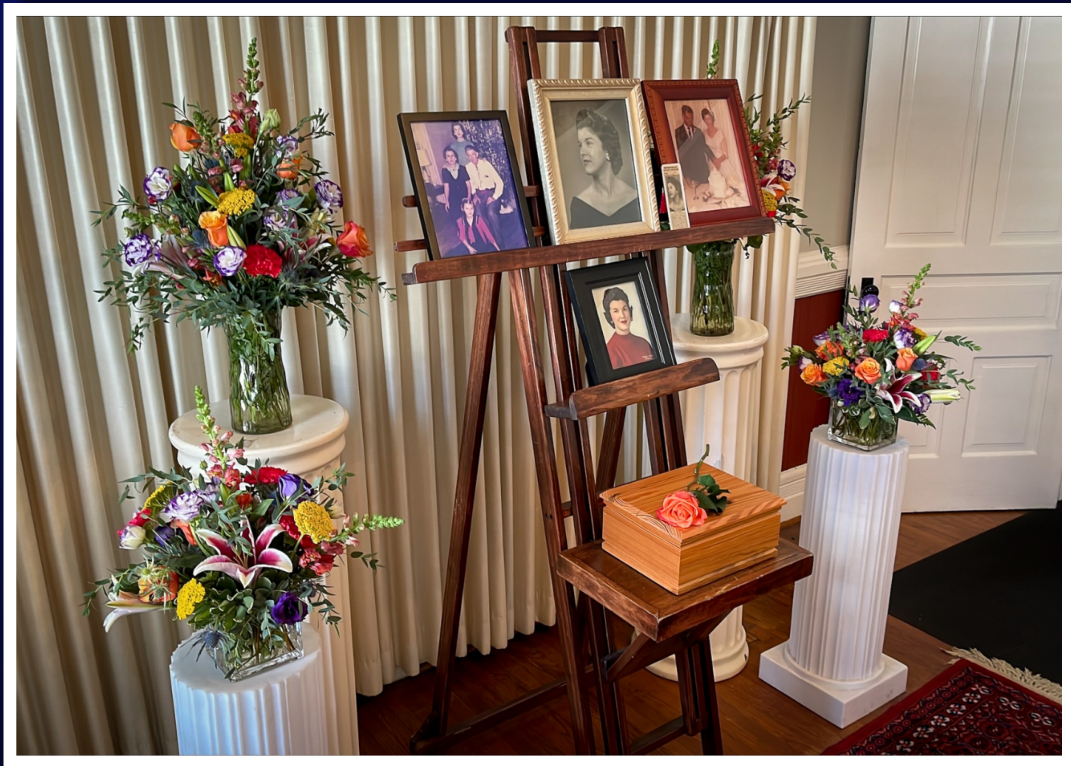
Monroe County Memorial Chapel