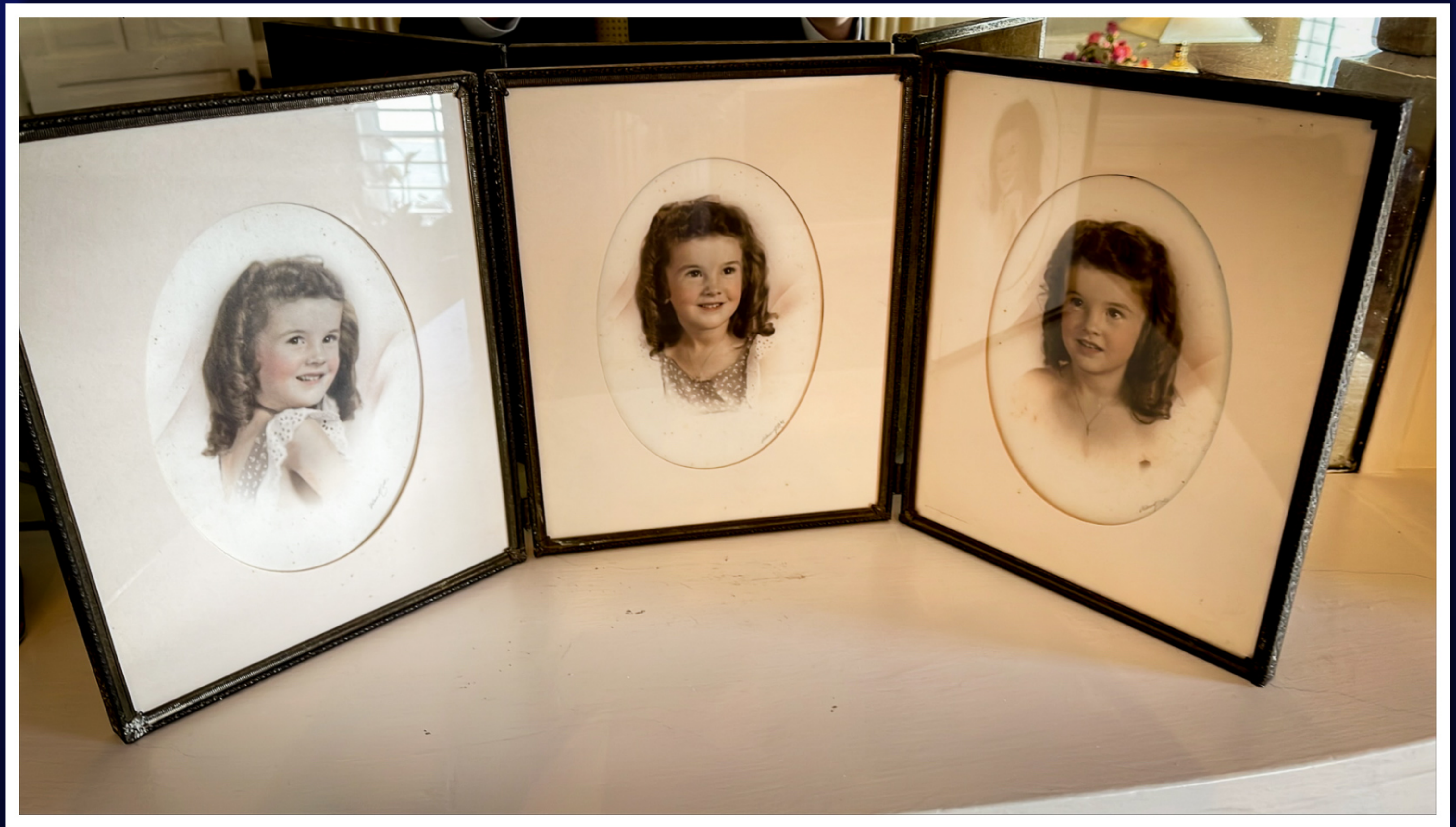
Monroe County Memorial Chapel