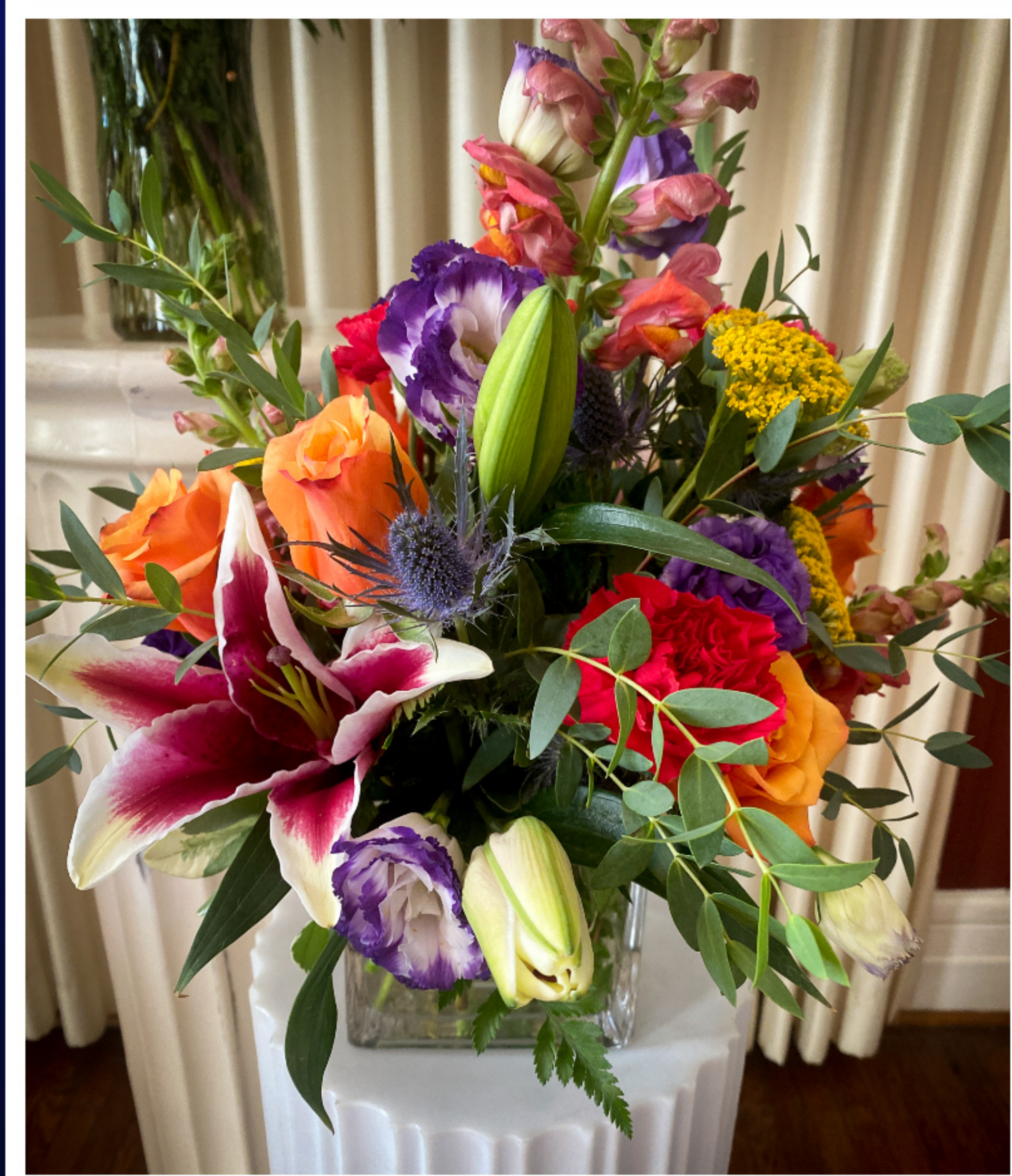
Monroe County Memorial Chapel