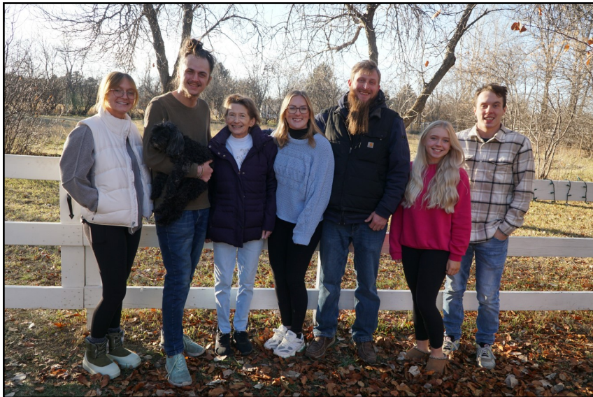
GRANDCHILDREN Thanksgiving, 2023