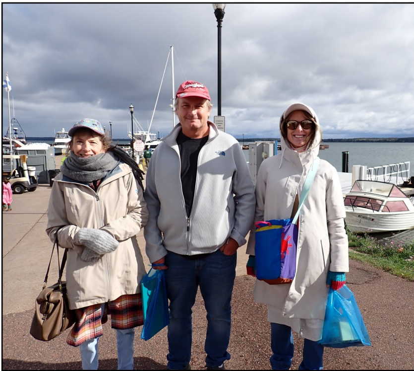
Bayfield, Wisconsin October, 2023