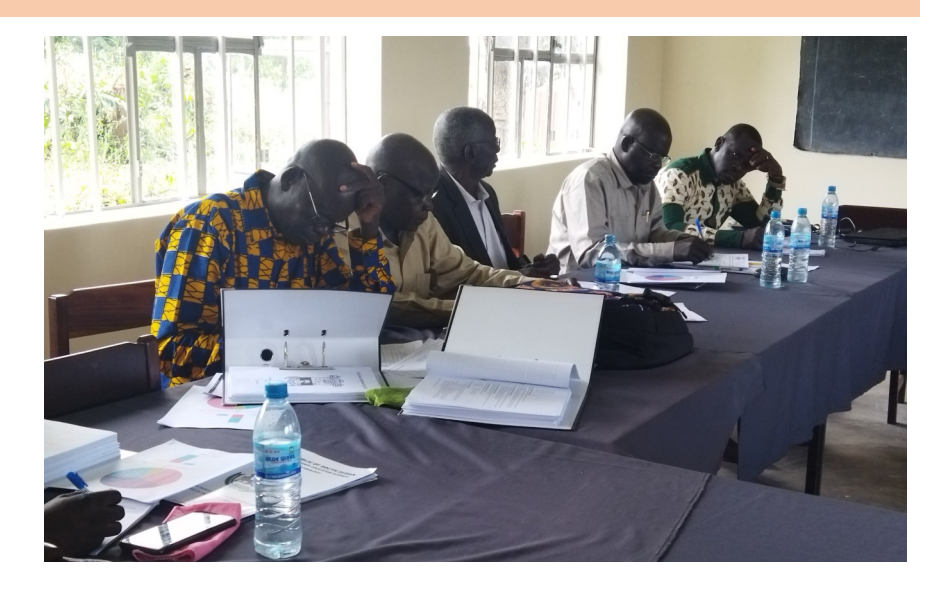
The verification committee checking the college curriculum

The visit was a continuation of the registration process that started in 2012, by then the college was offered a certificate of no objection to continue operating as the accreditation process was ongoing.