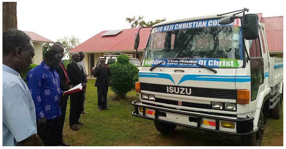
Dedication of the tipper lorry for use

The lorry wad dedicated to start operating on the 27th of may 2022 by Rt. Rev Bishop Anthony Poggo