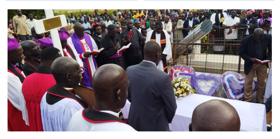
The body of the late Bishop being laid to rest