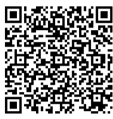
Tribute Video QR Code