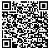
Guestbook QR Code