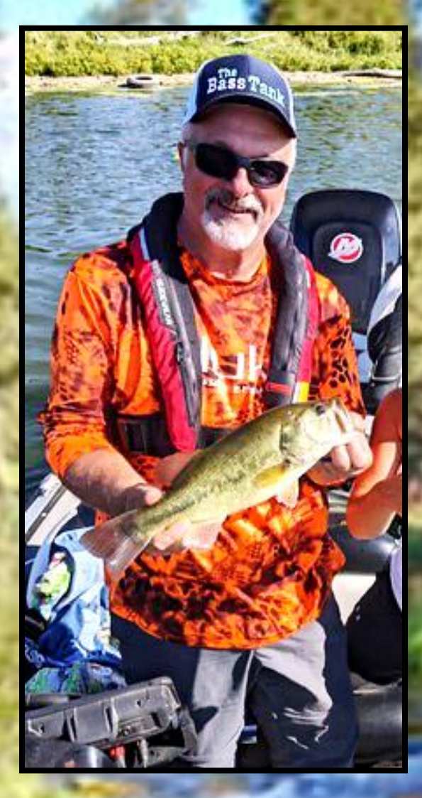
Ephesians 6:10 "Finally, be strong in the Lord and in His mighty power."