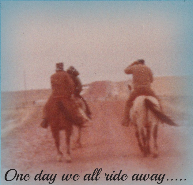
One day we all ride away.....

Lunch will be served at the fairgrounds following the service. Everyone is welcome.