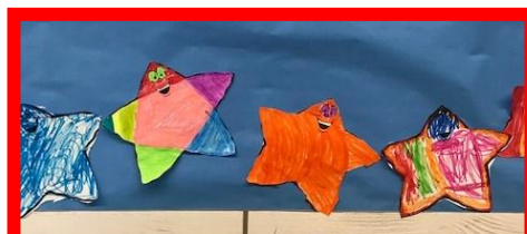
Kindergarten's creative STAR FISH!