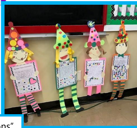
Grades 1-3 "New Year's Resolutions"