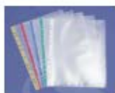
Clear Page Protectors