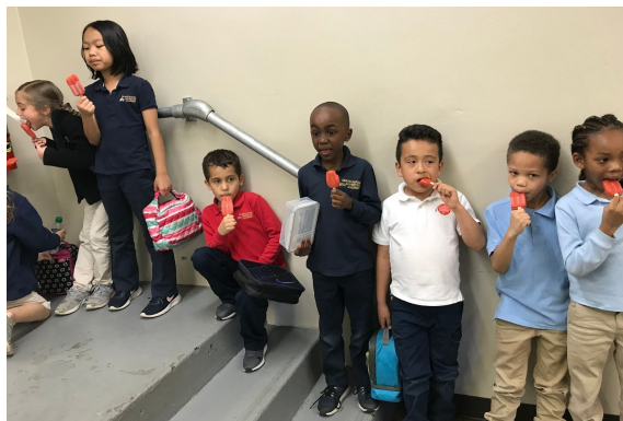
K-2 Enjoying an after lunch treat - popsicles!