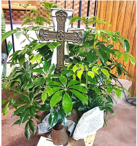
Love, The Lightning Family