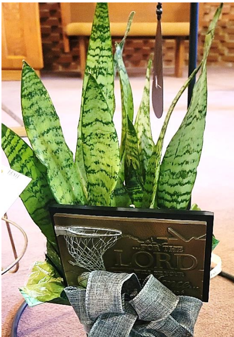
Boys Basketball & Girls Basketball Teams of SHS