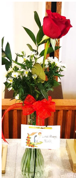
Love always, Rich