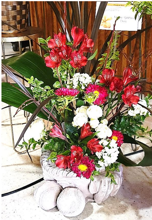
Menno Baseball Club