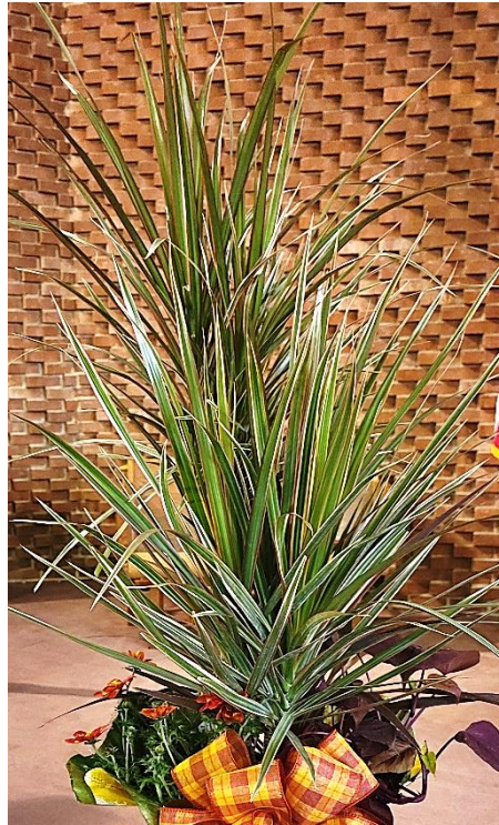
Greg Ryken & the crew at Stockmen's Livestock