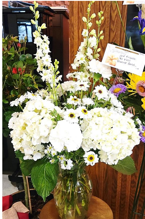
Your friends at First Premier Bank