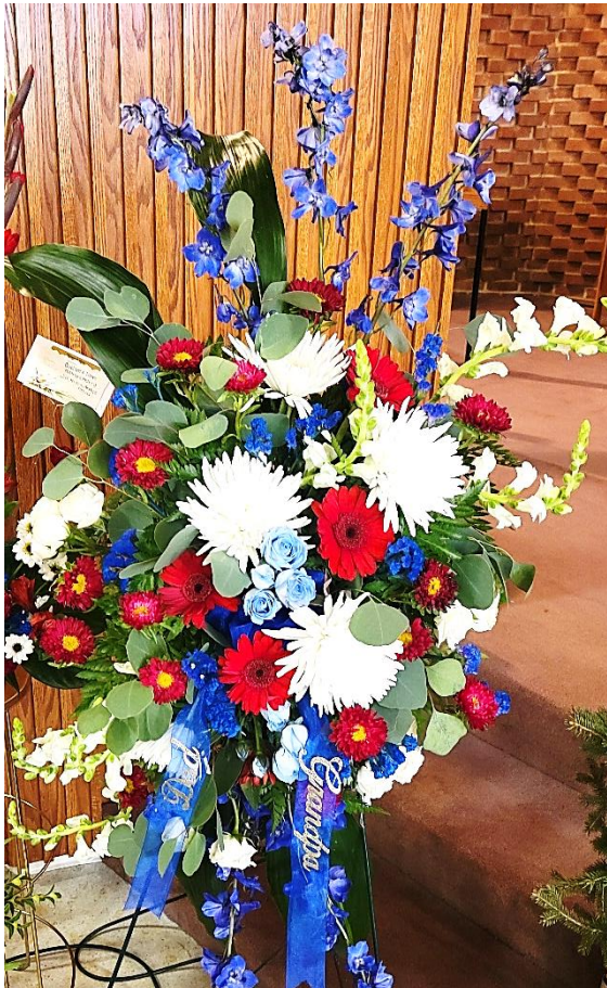
Dad ~ Grandpa