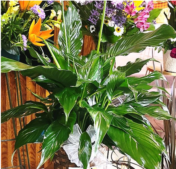
Thinking of you & wishing you peace. Your Avera Family