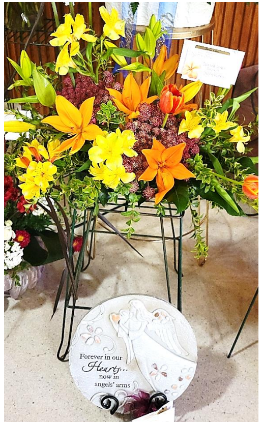
Scotland School District Staff & Board