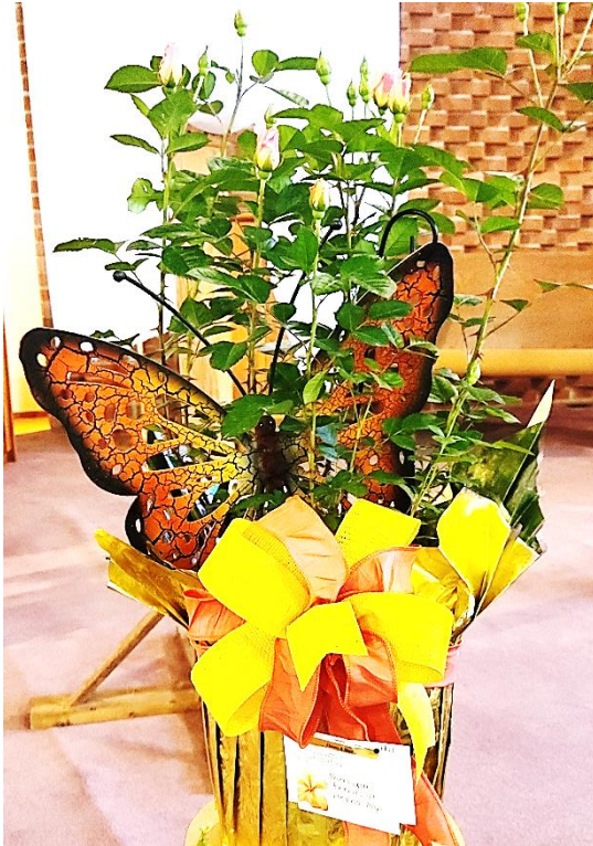
Your friends at Helena Agri