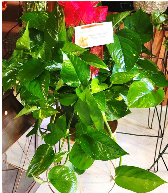
Kaylor, Parkston & Tabor Grain