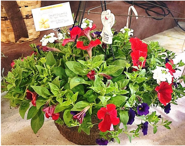
Deepest sympathy to your family. Menno School Office Staff