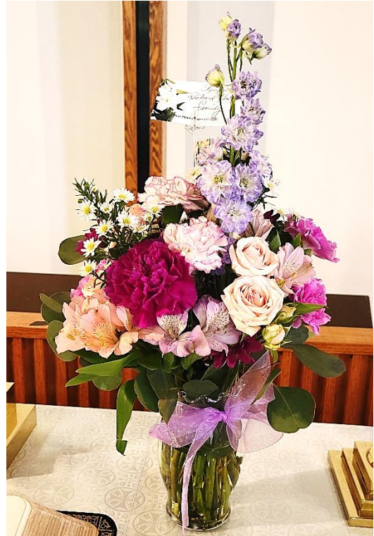
Pied Piper, Flowers & Gifts