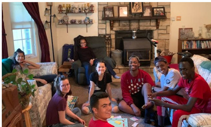
8th graders on their 8th Grade Trip!