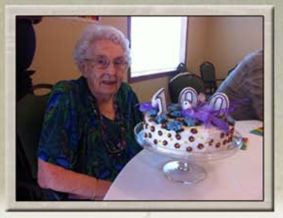
The Lord is my Shepherd, I shall not want.

He makes me lie down in green pastures: He leads me beside quiet waters.