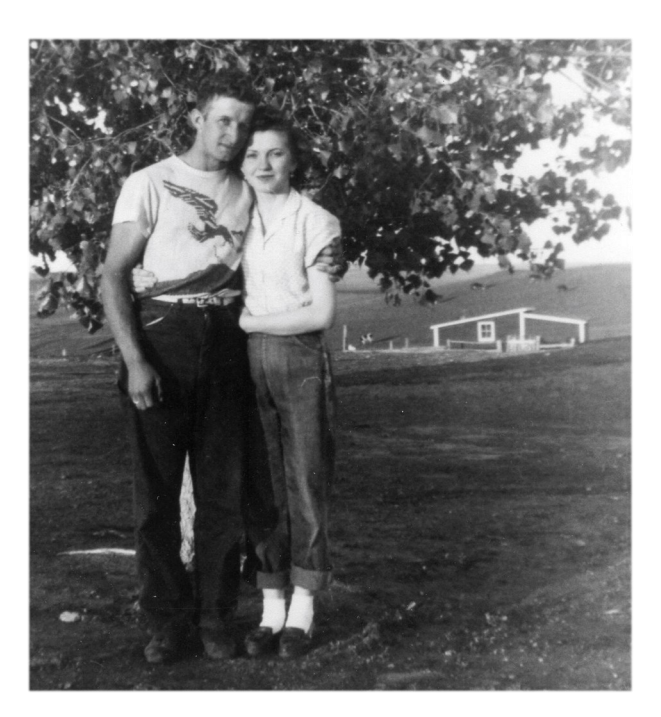
For Those I Love & Those Who Love Me

When I am gone, release me, let me go... I have so many things to see and do. You mustn't tie yourself to me with tears, be happy that we had so many years. I gave you my love, you can only guess how much you gave me in happiness.