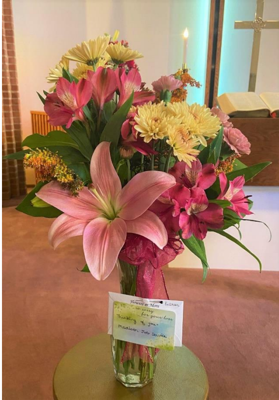
Thinking of you ~ Madison Job Service