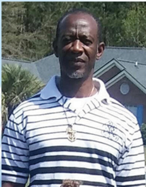
Sunrise February 14, 1971