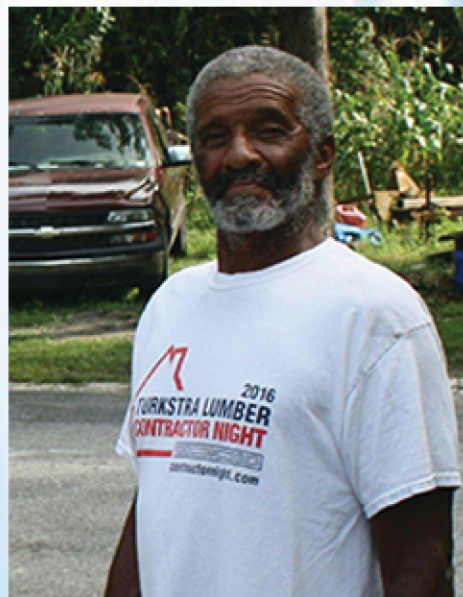
Sunrise January 22, 1952