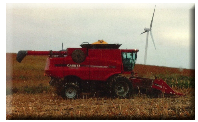
Arrangements By HARTQUIST FUNERAL HOME

Interment Woodstock Cemetery Woodstock, Minnesota