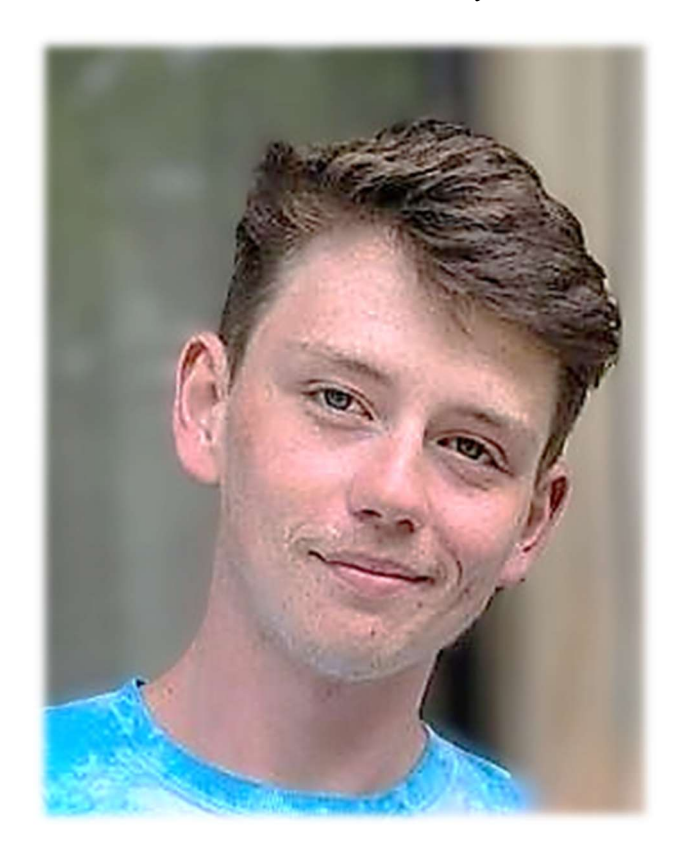
Saturday, July 27, 2024